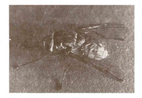
Figure 5: Stable fly.