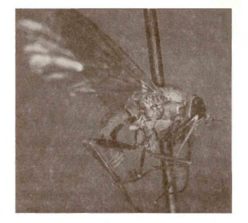
Figure 4: Snipe fly.

The horn fly, about one half the size of the stable fly, is a more injurious pest of cattle since it spends most of the day on its host, biting and feeding on blood 20 to 30 times during a 24-hour period. These flies can occur in groups of several hundred or more feeding on an individual host and cause severe irritation and economic loss. The horn fly is not considered to be a pest of humans, although it will sometimes bite humans who are in close proximity to infested animals. Larvae develop in dung of cattle.