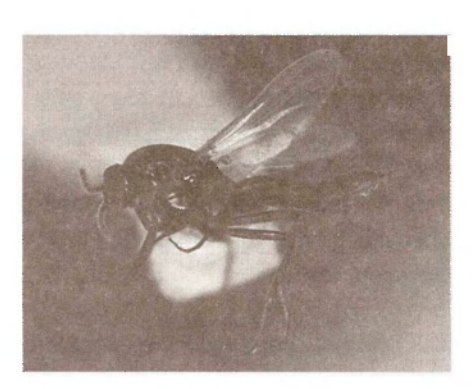
Figure 2: Biting midge, greatly enlarged.

Leptoncocops midges. Within Colorado, problems with Leptoconops midges are restricted to the Western Slope. Historically, areas around the Colorado National Monument have reported problems most frequently. Adults bite during the day, particularly during mid-morning and near dusk. Although peak biting usually occurs during a single period of the year, it typically lasts about two to three weeks, during which time outdoor activities can be greatly curtailed. Biting may also be more severe in years following periods of drought.