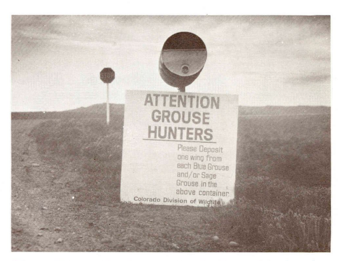
Fig. 1. Wing collection station in the field, showing sign and collection drum.

sonnel of the Arizona Game and Fish Department (Fig. 1). It consists of a 30-gallon metal drum with the supporting mechanism consisting of a single metal fence post (7 ft.) and 4 ft. 2 in. of 2-in.-diameter pipe (Fig. 2). The pipe screws into a 2-in.-diameter floor flange attached to the drum and slips over the fence post which is driven into the ground. These modifications permit a significant reduction in cost and labor, compared to the Arizona design.