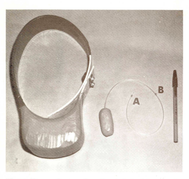
Fig. 1. Transceiver neck-collar, left, and heart-pulse transmitter, right, used to monitor heart-rates of deer. Two stainless steel electrodes exit from transmitter within a protective teflon plastic tube and surface outside the tube (points A and B) to contact animal tissue.