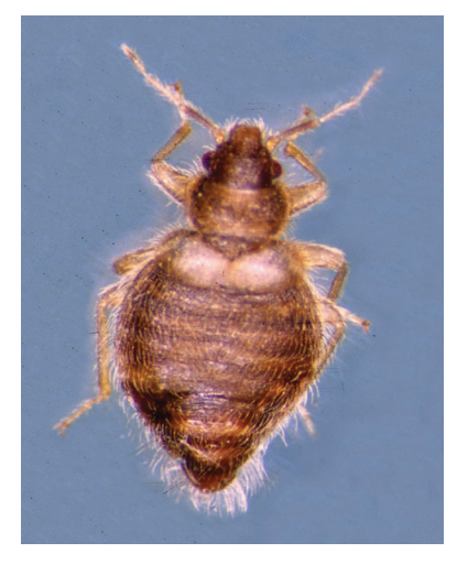
Figure 2: Hesperocimex coloradensis

All of these species are generally similar in appearance. They are reddishbrown to grayish-brown with an oval body form and about 3/8-in long when full-grown. All are wingless, although small wing pads are present on the back. Their body is flattened when unfed, although they swell rapidly with a blood meal. The various species found in Colorado can be separated by patterns of hairs, wing-pad structures and other features that are summarized in Figure 9.