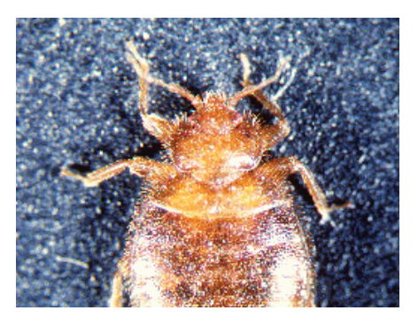
Figure 8: Bat bug, head end.

migrating swallows. If nests are removed in summer after they are abandoned by the swallows, then an insecticide treatment to the nest site may be used to kill some of the dormant swallow bugs that remain in hiding around the nest. However, some insecticides (e.g., chlorpyrifos) are highly toxic to birds. Do not apply them to areas that are currently visited by swallows.