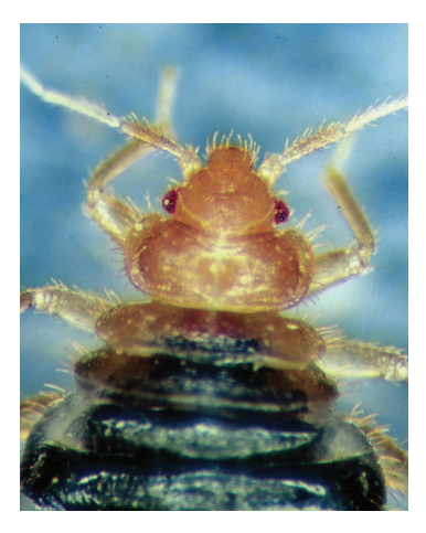
Figure 7: Bed bug, head end.

migrating swallows. If nests are removed in summer after they are abandoned by the swallows, then an insecticide treatment to the nest site may be used to kill some of the dormant swallow bugs that remain in hiding around the nest. However, some insecticides (e.g., chlorpyrifos) are highly toxic to birds. Do not apply them to areas that are currently visited by swallows.