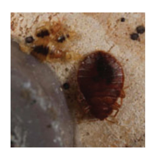
Figure 5: Bed bug adult and nymphs.

Sheets and other bedding can be easily disinfested by laundering that involves a dryer cycle. The high temperatures involved in drying are critical to successfully kill bed bugs, with exposure to temperatures exceeding 120F for a few minutes usually sufficient to kill all life stages. Washing, cool drying and dry cleaning may not kill all stages.