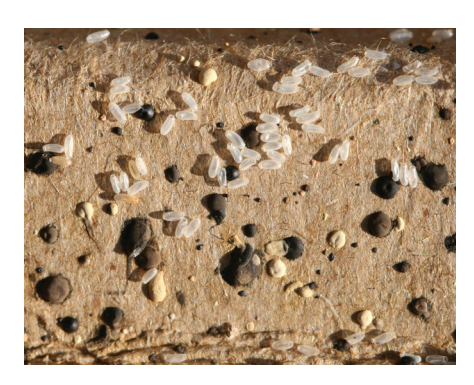
Figure 4: Bed bug egg shells and dried fecal spotting.

Nymphs can tolerate starvation for about three months. When food is available, bed bugs can continue to develop and reproduce year round, producing three or four generations annually.