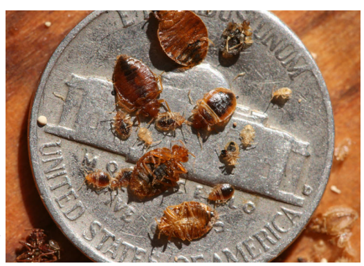
Figure 1: Various life stages and cast skins of bed bugs.

Bed bug (Cimex lectularius). The bed bug is a notorious species and is the only member of this insect family in Colorado that is adapted to living entirely with humans. For several decades following World War II it was largely eradicated form the United States, existing in only small pockets. However, within the past decade it has had tremendous