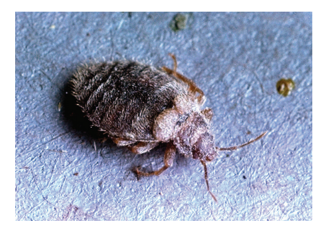
Figure 6: Swallow bug.

Swallows are protected species under Federal Law and it is illegal to disturb active nests. Nests can be destroyed prior to egg laying and areas where swallows previously nested can be screened off prior to the return of the