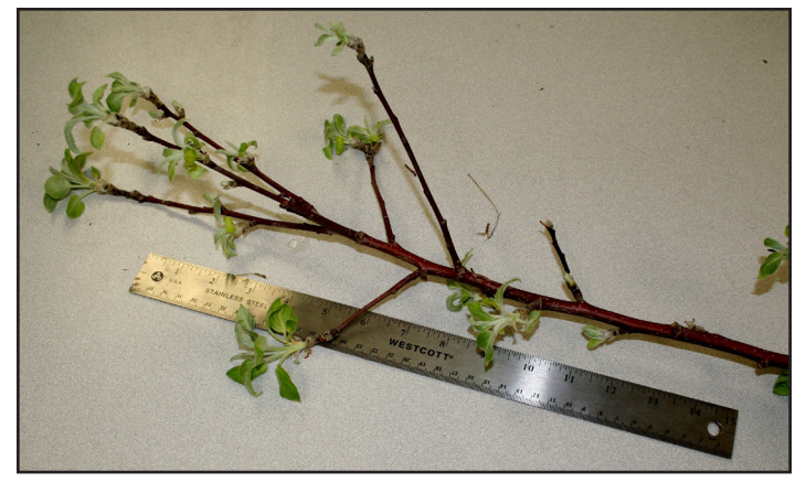
Good branch sample.