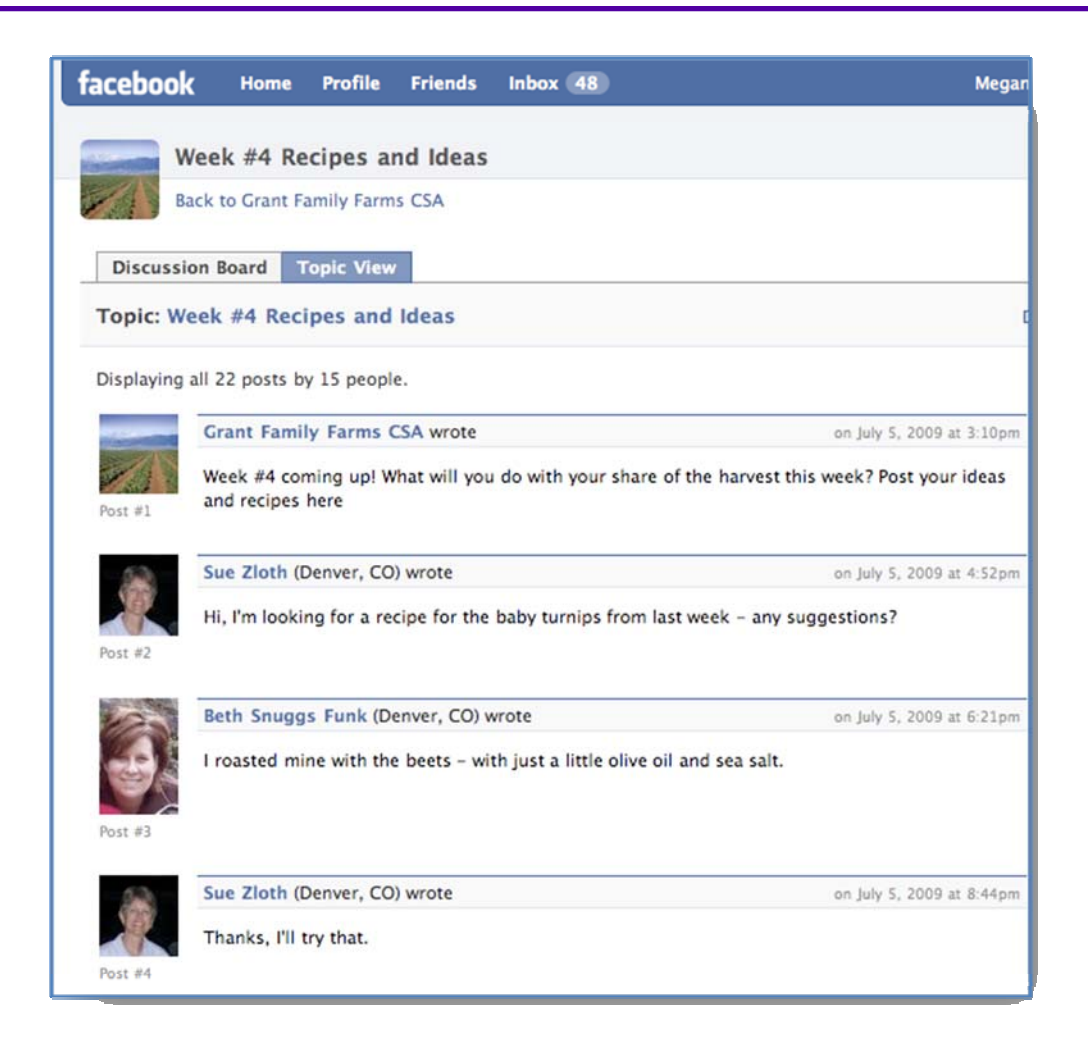
Figure 6: Screenshot from Grant Family Farm's Discussion Board