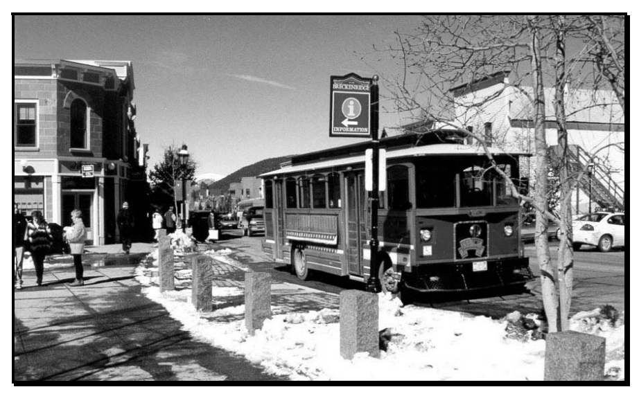
Breckenridge Main Street Shuttle