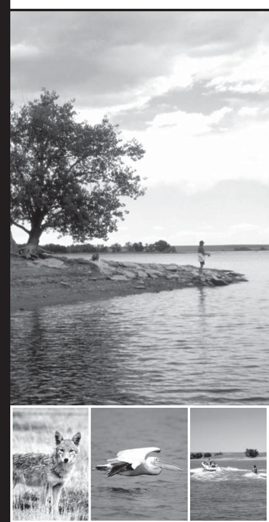
Visit all your Colorado State Parks at www.parks.state.co.us