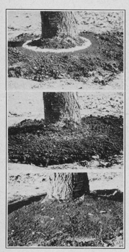
Middle—Ground prepared for PDB treatment.

and level. If borers are working above the ground level, draw in some fresh soil and pack it down firmly around the trunk so