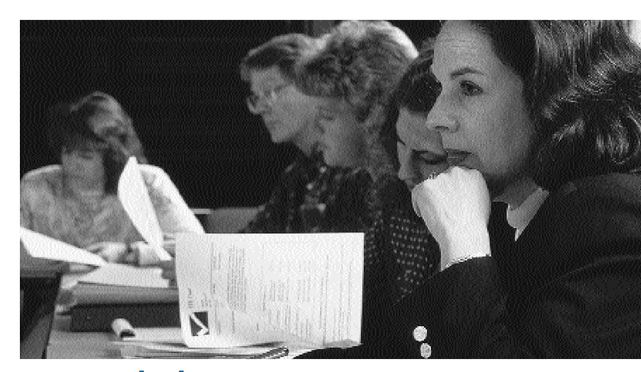
activity planner path process sample agenda