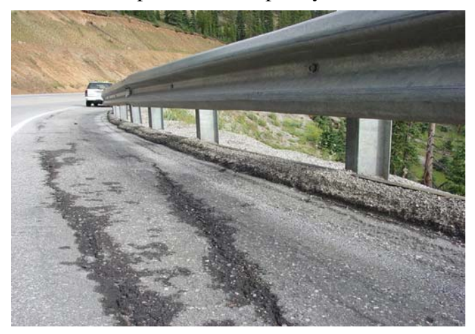
Figure 21. An asphalt berm in front of a wood curb.

material acts as a back form for the asphalt and, because the patch material adheres well to the surface of the pavement and poorly to the curb, the asphalt berm stays in place if the curb is