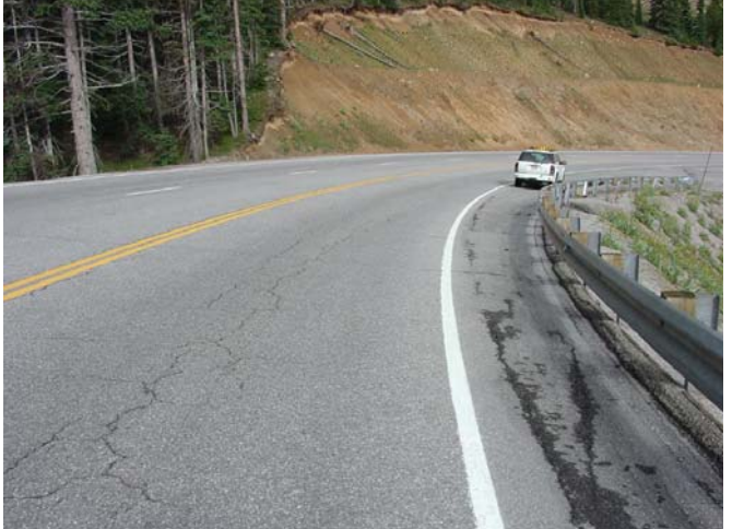
Figure 22. Wide highway and steep shoulders.

In the long term, neither DuraFlex Curb nor composite lumber can effectively control runoff and