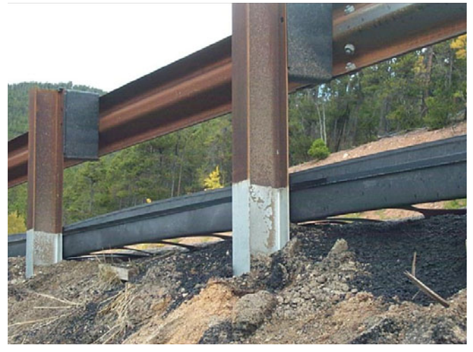
Figure 24. Inadequate base for the DFC.

prevent shoulder erosion under these conditions: