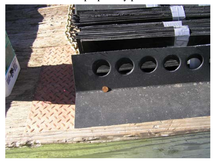
Figure 8. Holes in the horizontal leg of the DFC help the layers of asphalt bond together to strengthen the curb.

DuraFlex Curb is a proprietary product manufactured and sold by Keyway Curb Company of