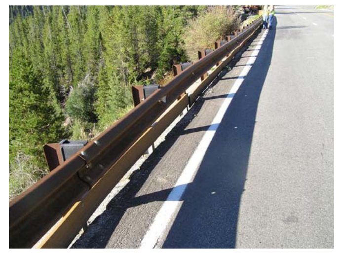
Figure 7. Slight movement of the guardrail can render the curb completely ineffective.

At both sites, most of the new guardrail was installed before the final mat was laid; as the old guardrail was removed new guardrail was placed immediately so that all areas were protected at all times. Unfortunately, having the block-outs and guardrail already in place prevented the paver and rollers from operating close to the guardrail posts, so the asphalt for about two feet out in front of the curb had to be placed and compacted by hand ( Figure 6 ). This resulted in lower density, hence, lower strength in the mat next to the curb.