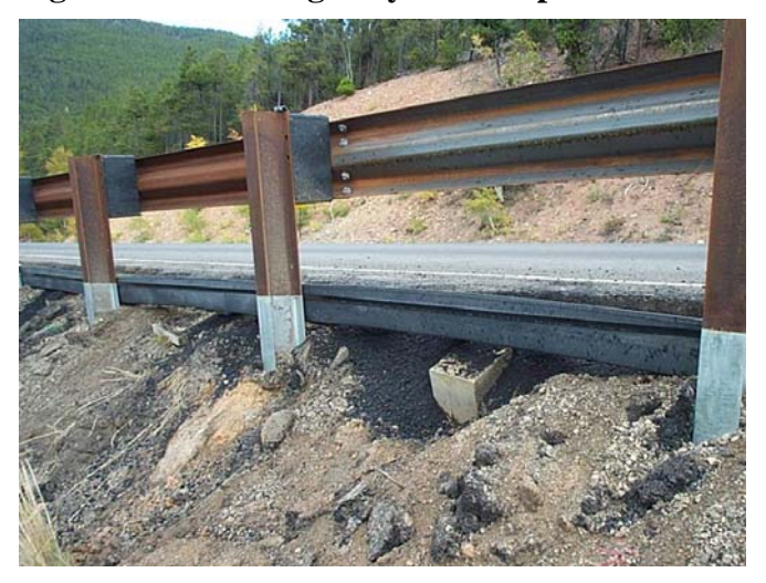
Figure 23. Slopes start under the guardrail.