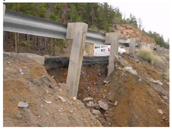
Figure 1. Dangerous erosion on US-50.

Along rural highways water from rain or melting snow has the potential to do severe damage to the roadway structure in a surprisingly short amount of time. Erosion in mountain areas is often exacerbated by very steep terrain, sparse ground cover, severe weather and the fact that the pavement serves as a collector for runoff. In some locations CDOT uses curbs of various