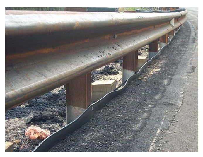
Figure 6. The edge of the pavement was placed and compacted by hand.

With lumber curbs, the top lift of asphalt presses against the face of the curb providing a tight fit, but any movement opens gaps in the curb. When the top lift of asphalt is laid with DFC, it is placed on top of the horizontal leg of the curb and binds through the holes in the leg to the pavement below. Because the bottom leg of the DFC is contained in the pavement slight movement of the vertical face will not break the bond with the asphalt.