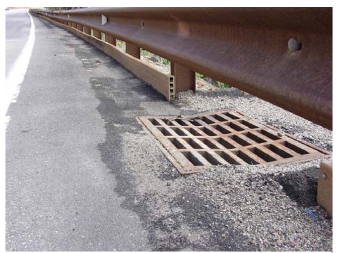
Figure 19. A hollow section of composite lumber curb ends at a drain.

Composite lumber, a man made product manufactured from recycled plastic and wood chips,