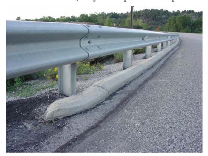
Figure 2. Extruded curb - concrete in this case.

effective, and are not easily damaged by traffic or normal maintenance operations such as snow removal. However, they are expensive. Repairs are difficult and installation of new extruded