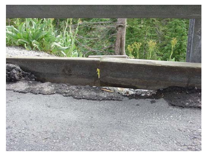
Figure 3. Wood curb can twist and warp.

split, crack, twist and warp ( Figure 3 ). That tendency is what led CDOT to try new curb materials.