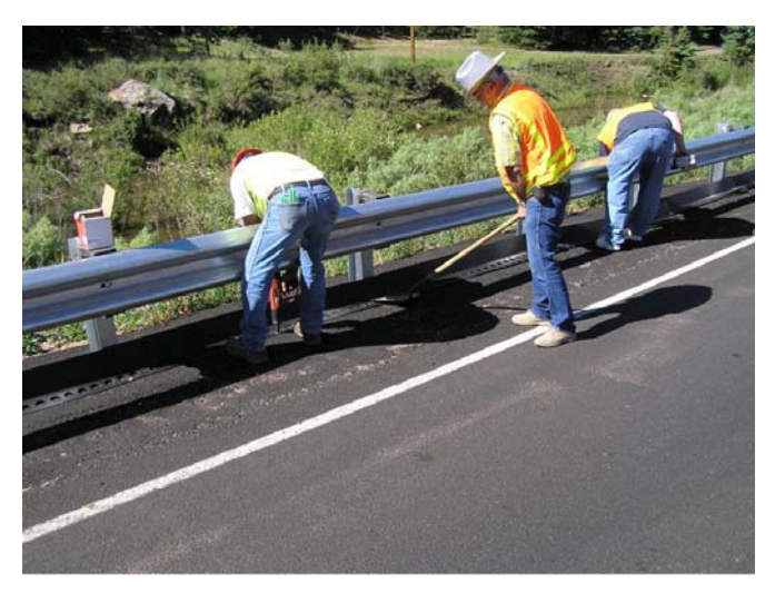
Figure 10. Holding DFC tight against the post base and the pavement with a shovel.

As Figure 8 shows on the previous page, the HDPE had a memory; it tried to return to its original flat shape rather than maintain a 90° bend. Because the curb material had partially flattened out, it was difficult for the installers to push it tight against both the bottoms of the guardrail posts and the surface of the asphalt at the same time. They used shovels to hold the curb in place while it was nailed to the pavement along the edge of the horizontal leg ( Figure 10 ). (The DFC was not nailed to the guardrail posts on US-24.)