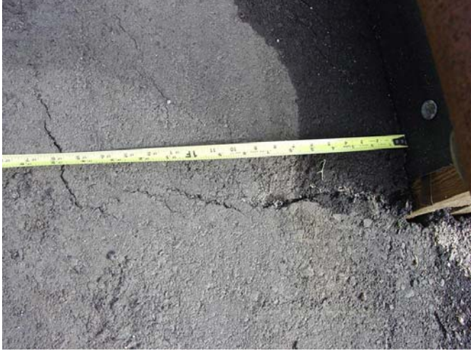
Figure 14. Cracks along the edge of the HDPE Figure 15. Cracks are developing at the end and on US-24.