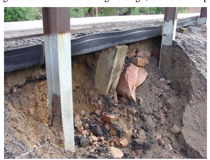
Figure 9. Without the support of the DFC, the edge of the pavement would have collapsed.

Integration of the curb into the pavement and the relative flexibility of the material, give the DFC some benefits over wood and composite curb materials. It is relatively impervious to small movements of the guardrail. With the horizontal leg embedded in the asphalt mat, the vertical curb is flexible enough to follow small movements of the guardrail posts without damage. If the guardrail movement is large enough, the nails will pull through the curb material leaving only a