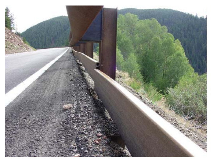
Figure 20. A small movement of the guardrail separated this curb from the pavement.

The composite curb used on Monarch Pass was a hollow 2 x 8 with four cross webs as shown in Figure 19 . Probably as a result of its hollow nature, the material had deformation problems, a low resistance to buckling and was fairly easily broken. Solid material may have performed better.