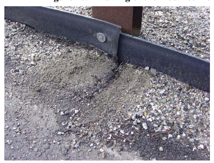
Figure 17. DFC nailed to a guardrail post on US-50.

The horizontal leg is 1/8 inch thick and has a row of 12 inch diameter holes spaced one inch apart along its length. When the asphalt is laid over the curb, the larger diameter the holes provide more area to improve the bond between the asphalt lifts and help make the curb become a part of the pavement. The curb sections are light and easy to transport and handle - the entire quantity of \pm 2000 feet for the project was delivered on a 15 foot goose neck trailer.