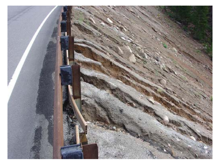
Figure 5. Severe erosion can occur very rapidly.

site where CDOT installed DuraFlex Curb and the first use of composite lumber as curbing material. US-50 on the west side of the pass is steep with two through lanes and a passing lane in most places. The speed limit is 45 mph.