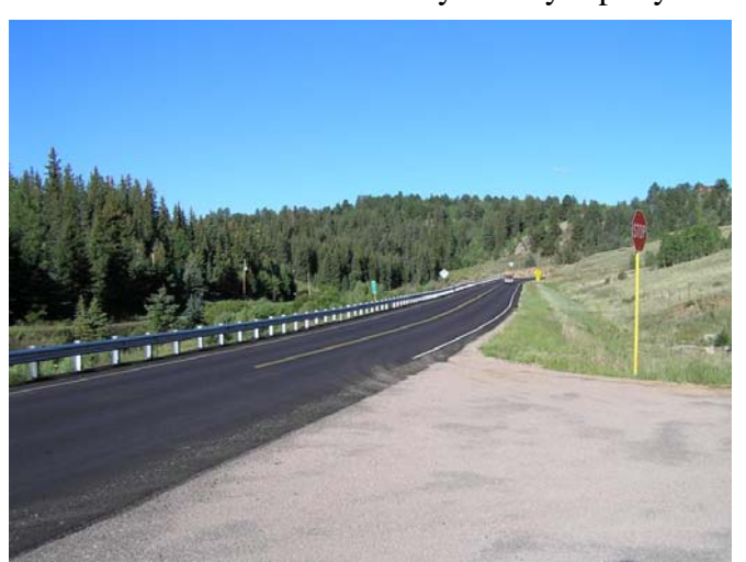
Figure 25. US-24 on Ute Pass.

Satisfactory performance can probably be expected in locations where the consequences of a break or overflow are not likely to very rapidly lead to severe structural problems for the