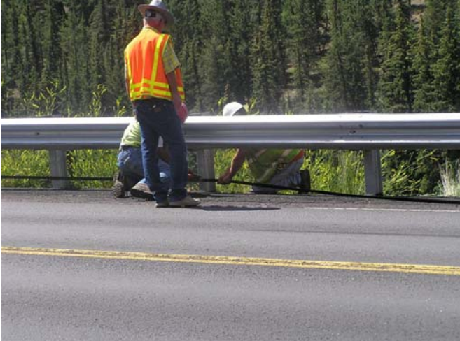
Figure 12. Wavy curb face between guardrail posts is mainly a cosmetic problem.