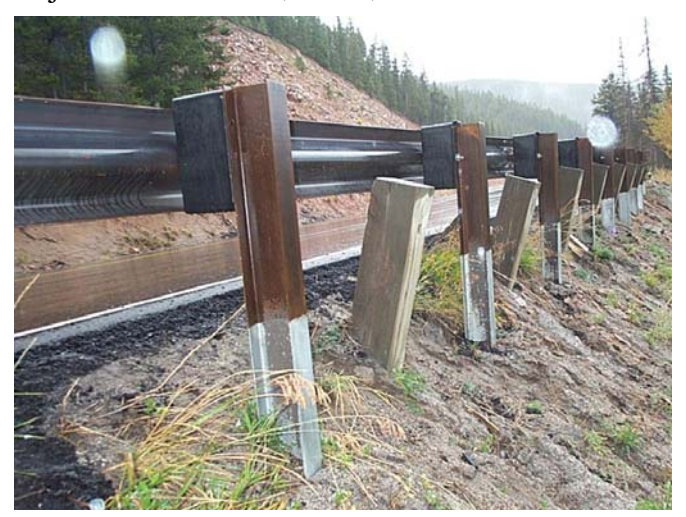
Figure 4. US-50 has steep slopes to both sides.

Project NH 0502-055, on 11,300 foot Monarch Pass in south-central Colorado, was the second