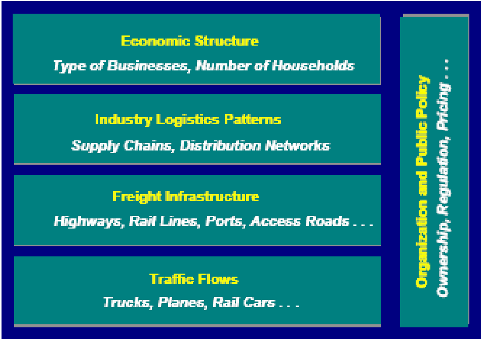
Figure 2.1 Freight Transportation System Data and Trends

This study assembled transportation and economic data from a multitude of sources to develop a comprehensive picture of goods movement in the region. It drew from previous studies such as a statewide roadside truck survey, statewide TRANSEARCH freight flow data. The study also benefited from pre-existing economic and employment data provided by the regional economic development organization, ABAG. To implement a similar study, truck survey and economic data would be needed in Colorado. Specific data needs to implement this program would be economic data, rail traffic data, WIM data, roadside truck survey data, and inter-regional trade data.