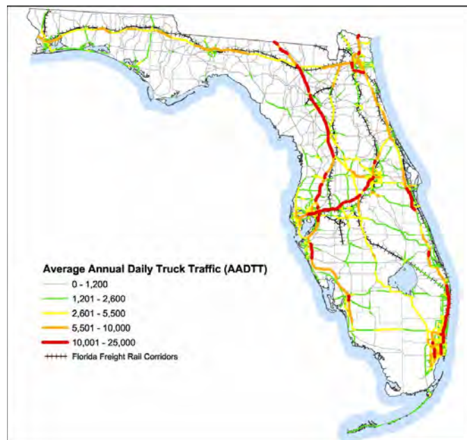
Figure 2.2 Truck Highway Volumes in Florida, AADTT