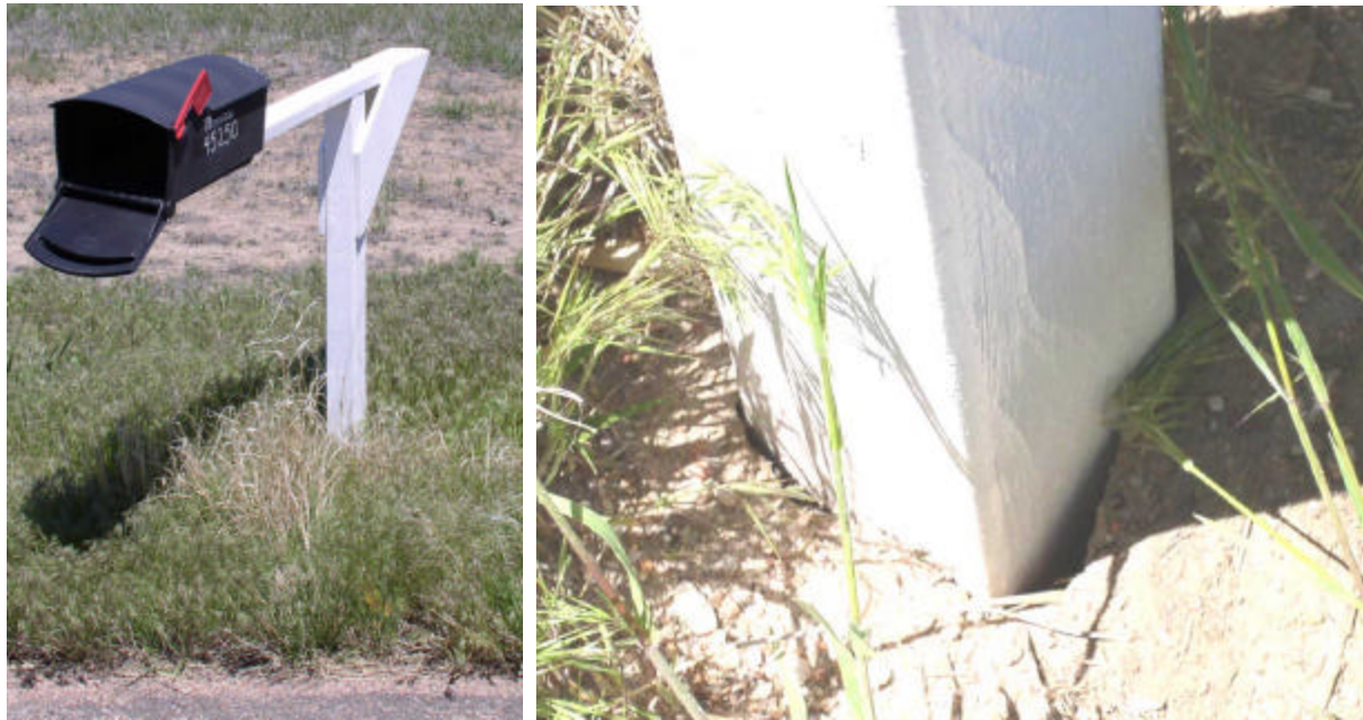
Figure 5. The plastic box is good condition, but the twisted post shows the effects of being hit by the snow thrown by passing plows.

This system, with a cost of $28.38 for the materials, and assembly and installation time of 2