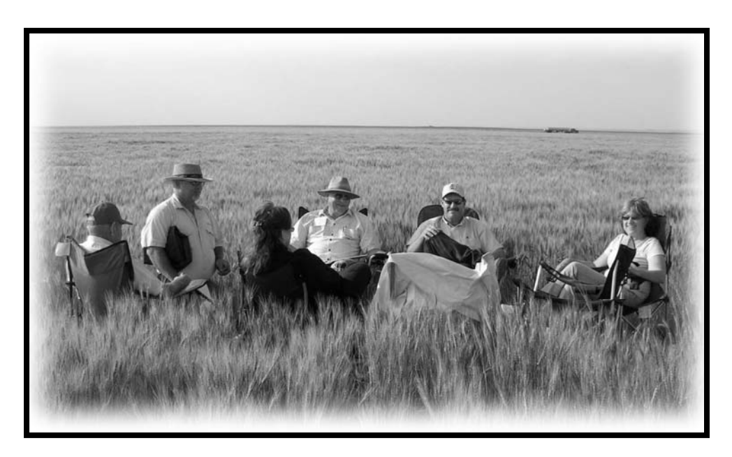
Wheat Field Days 2006 Lamar

The Colorado Conservation Tillage Association (CCTA) was founded in 1988 to serve the needs of producers searching for new ways to diversify their farms and better utilize their resources. Each year, producers, agricultural business professionals and educators from Colorado, Kansas, Nebraska and Wyoming come together to learn new techniques and the latest technology about products, equipment and research on no-till, minimum–till, conservation practices; and discuss current farming issues. Traditionally a wheat-summer fallow area of the Great Plains, the High Plains region has seen dramatic change in climate, water availability, alternative fuel use, alternative crops and cropping methods—all issues to be addressed, in part, by CCTA at the 20<sup>th</sup> Annual High Plains No-Till Conference, to be held February 5-6, 2008 at Island Grove Regional Park Events Center, Greeley, Colorado. For more information about this educational conference go to <u>www.HighPlainsNoTill.com</u>.