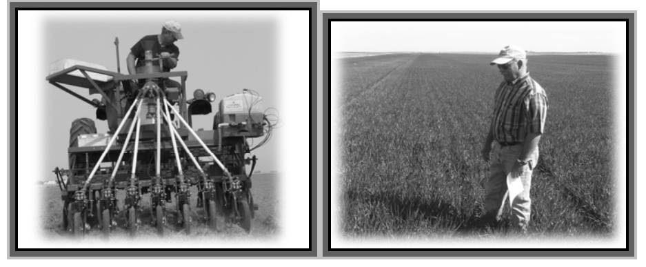
Jim Hain Crop Testing Planting Wheat (left) and Ron Meyer Wheat Extension Educator (right).

<sup>1</sup>Varieties in table ranked by the average yield over 11 locations in 2006.