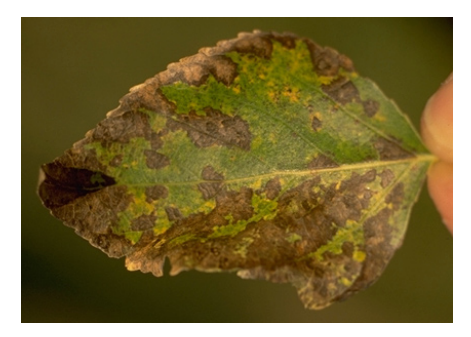
Figure 4: Septoria leaf spot showing irregular brown to black spots.