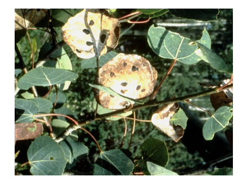
Figure 6: Ink spot disease on aspen in midsummer.

The appearance of Septoria leaf spots varies considerably between tree species and with time. Symptoms include a distinct tan circular spot with black margins and small black pimples in the center (Figure 3), and irregular brown to black spots that coalesce into large areas (Figure 4).