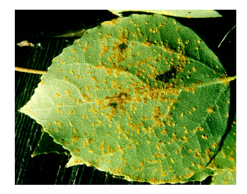
Figure 8: Leaf rust.

The disease is easily recognized by small, yellow-orange pustules that are scattered on the lower leaf surfaces (Figure 8). These orange pustules are most visible in late summer and early fall.