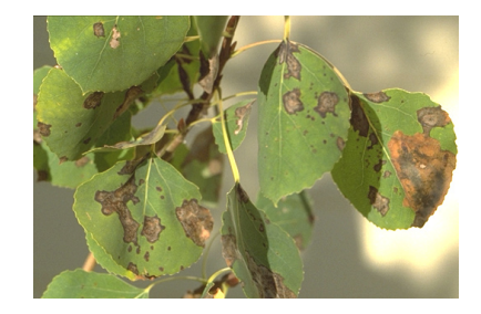
Figure 2: Marssonina leaf spot on aspen, late symptoms.