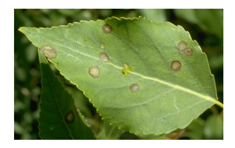
Figure 3: Septoria leaf spot showing tan circular spots.