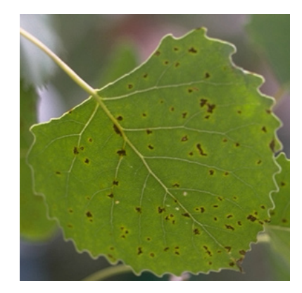
Figure 1: Marssonina leaf spot on cottonwood.

Marssonina leaf spots are dark brown flecks, often with yellow halos (Figure 1). Immature spots characteristically have a white center. On severely infected leaves, in wet weather, several spots may fuse to form large black dead patches (Figure 2). Spots also may develop on leaf petioles and succulent new shoots. Marssonina survives the winter on fallen leaves that were infected the previous year (Figure 9). With spring and warmer, wet weather, the fungus produces microscopic "seeds" or spores that are carried by the wind and infect emerging leaves. Early infections are rarely serious, but if the weather remains favorable, spores from these infections can cause a widespread secondary infection. Heavy secondary infections become visible later in the growing