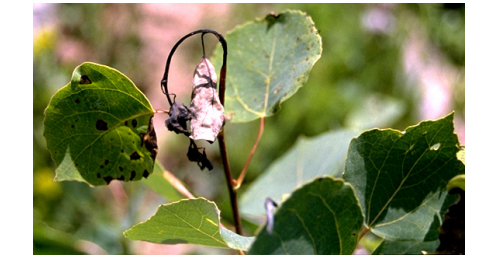
Figure 7: Shoot blight on aspen showing black and curled stem.

A rust disease caused by the fungus Melampsora is often seen on aspen