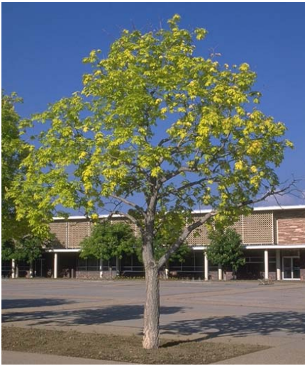
Figure 5: Yellow, chlorotic foliage from root disease.