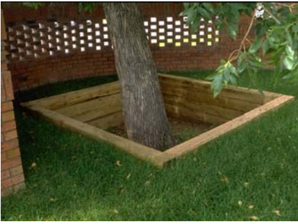
Figure 2: Tree wells cannot compensate for the addition of soil over tree roots.