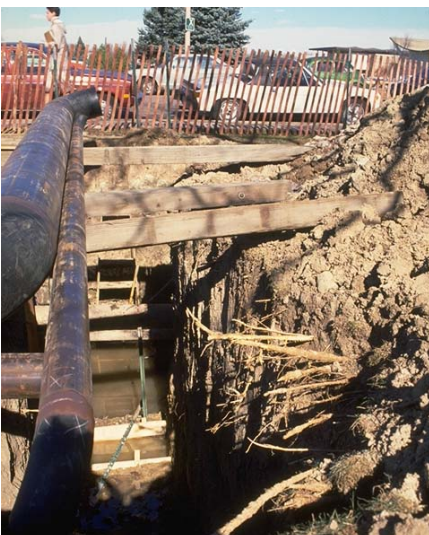
Figure 4: Trenching can severely injure a tree. Instead, auger under roots.

together) and soil temperature. In general, as the depth increases, soil compaction increases, while the availability of water, minerals, oxygen and soil temperature all decrease. In some instances, hard, compacted soil (hardpans) can occur near the surface, which restricts root growth.