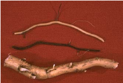
Figure 6: Top to bottom: healthy feeder root, dead feeder root, and large, perennial root.