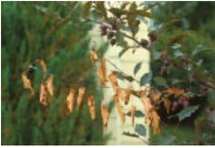
Figure 2: Blighted leaves on ornamental apple.