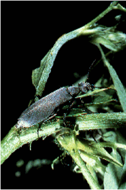
Figure 2: E. fabricii , a blister beetle common in June in Colorado.

associated with grasshopper outbreaks. Consequently, alfalfa grown near rangeland has a greater likelihood of blister beetle infestation.