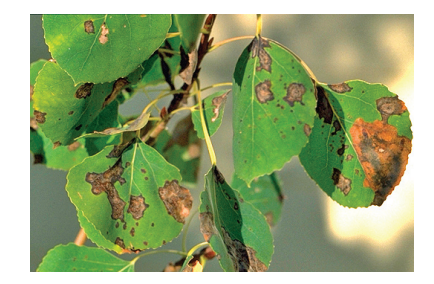
Figure 2: Marssonina leaf spot on aspen, late symptoms.