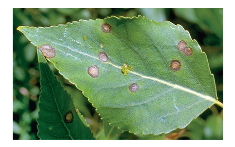
Figure 3: Septoria leaf spot showing tan circular spots.