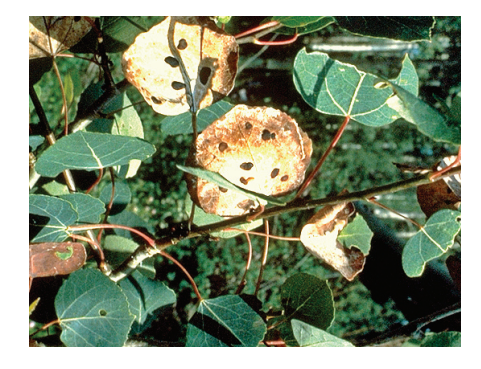
Figure 6: Ink spot disease on aspen in midsummer.

The appearance of Septoria leaf spots varies considerably between tree species and with time. Symptoms include a distinct tan circular spot with black margins and small black pimples in the center (Figure 3), and irregular brown to black spots that coalesce into large areas (Figure 4).