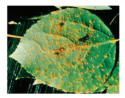
Figure 8: Leaf rust.

The disease is easily recognized by small, yellow-orange pustules that are scattered on the lower leaf surfaces (Figure 8). These orange pustules are most visible in late summer and early fall.