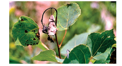
Figure 7: Shoot blight on aspen showing black and curled stem.

A rust disease caused by the fungus Melampsora is often seen on aspen