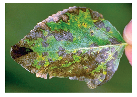
Figure 4: Septoria leaf spot showing irregular brown to black spots.