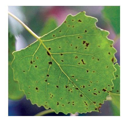
Figure 1: Marssonina leaf spot on cottonwood.

Marssonina leaf spots are dark brown flecks, often with yellow halos (Figure 1). Immature spots characteristically have a white center. On severely infected leaves, in wet weather, several spots may fuse to form large black dead patches (Figure 2). Spots also may develop on leaf petioles and succulent new shoots. Marssonina survives the winter on fallen leaves that were infected the previous year (Figure 9). With spring and warmer, wet weather, the fungus produces microscopic "seeds" or spores that are carried by the wind and infect emerging leaves. Early infections are rarely serious, but if the weather remains favorable, spores from these infections can cause a widespread secondary infection. Heavy secondary infections become visible later in the growing