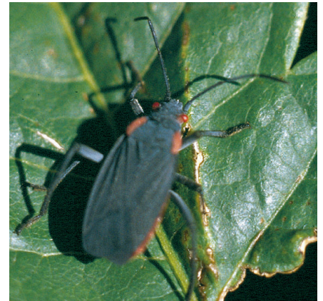
Figure 5: Goldenrain tree bug.

Use a vacuum cleaner to control bugs that have entered the house. Household insecticidal aerosols and many household spray cleaners also are effective when applied directly to individual insects. These measures provide temporary relief only. Bugs may continue to enter the home as they move about on warmer days throughout the fall, winter and early spring. Nuisance infestations should be finished by late May, as the boxelder bugs have either died or moved back to the host trees.