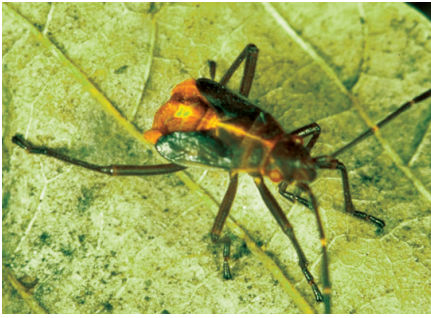
Figure 3: Boxelder bug nymph.