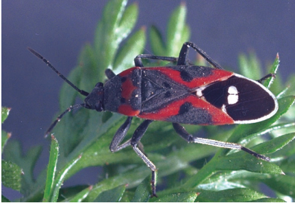
Figure 4: The small milkweed bug is a seed feeding bug that resembles the boxelder.