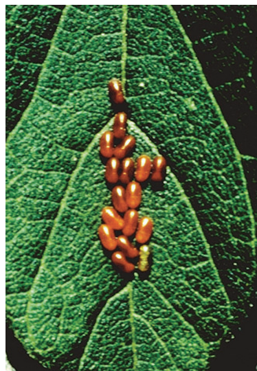
Figure 2: Boxelder bug eggs on leaf.

Boxelder bugs are primarily a nuisance pest, annoying residents by crawling on exteriors and inside dwellings on warm fall and winter days. They also may stain draperies and other light-colored surfaces and produce an unpleasant odor when crushed, but these are not major problems. They do not reproduce during this period. They may attempt to feed on house plants but do not cause any damage. On rare occasions, they have been reported to bite humans.