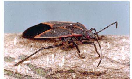
Figure 1: Boxelder bug.

For most people, the boxelder bug needs no introduction. This bug is about 1/2 inch long as an adult, black with three red lines on the thorax (the part just behind the head), a red line along each side, and a diagonal red line on each wing. The immature forms (Figure 6) are smaller and are easily distinguished from the adults (Figure 7) by their red abdomens and lack of wings. Boxelder bugs become a nuisance in and around homes from fall through early spring.