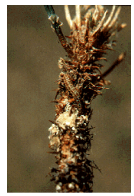
Figure 1: Ponderosa pine budworm larva in infested shoot.

The larvae continue to feed as the foliage develops, going through a succession of moults before reaching the pupal stage in late June. The feeding larvae produce a great deal of silk that