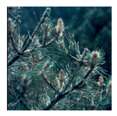
Figure 3: Pine shoots damaged by budworm feeding.