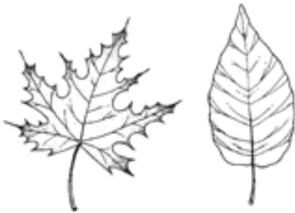
Left: Palmately veined broadleaf leaf. Right: Pinnately veined broadleaf leaf. Far Right: Examples of narrowleaf leaves.

Grass-like plants have narrow leaves, usually arising from the base of the plant. The leaves may be soft (ornamental grasses) or stiff (yucca).