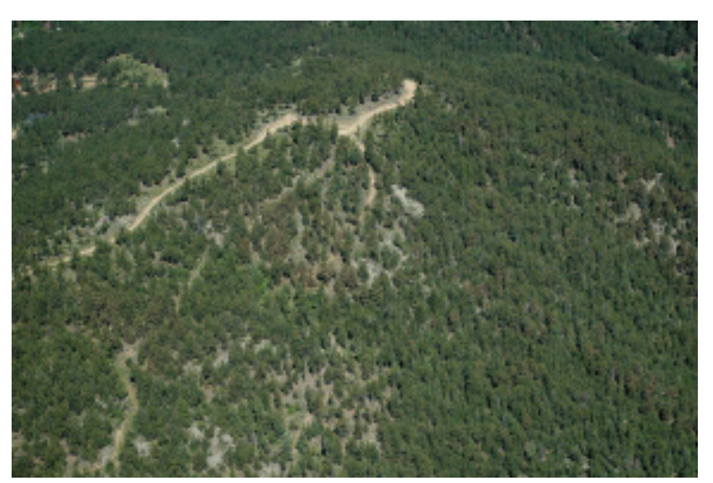
Figure 3: Aerial view of Ponderosa pine needle damage. Notice light discoloration of trees.

So far, most needle miner-caused defoliation has been an aesthetic problem only. Miners prefer older needles, and these provide relatively little food to the tree. However, recent evidence suggests that several years of heavy feeding does result in visible tree decline, as shown by reduced needle length and