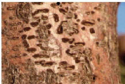
Figure 1: Thyronectria canker with dark fruiting bodies of the fungus pushing through the bark.