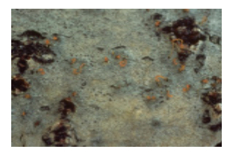
Figure 3: Orange spores oozing from pycnidia.

<sup>1</sup> Colorado State University professor, bioagricultural sciences and pest management.