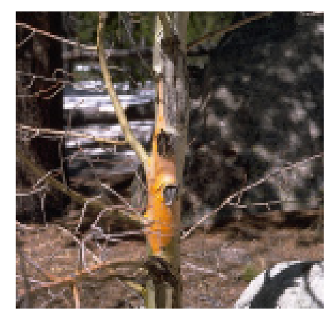
Figure 1: Orange discoloration found in spring and early summer associated with cytospora canker.