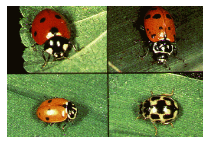
Figure 3a: Lady beetle adult.