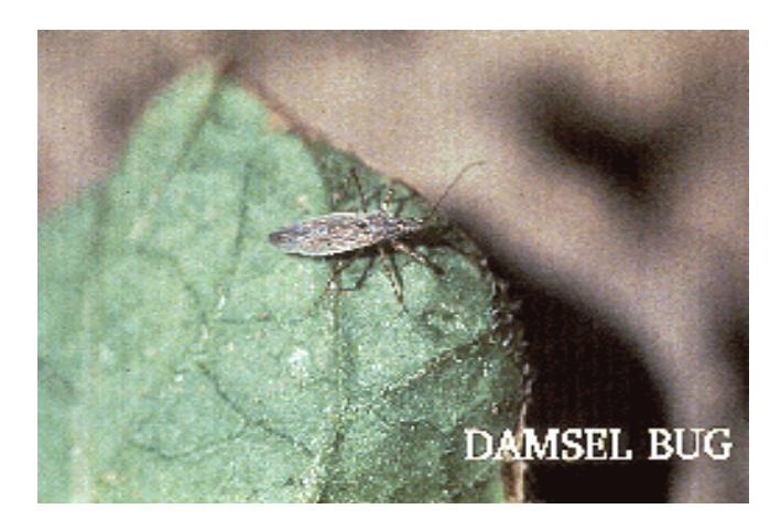
Figure 3e: Damsel bug.