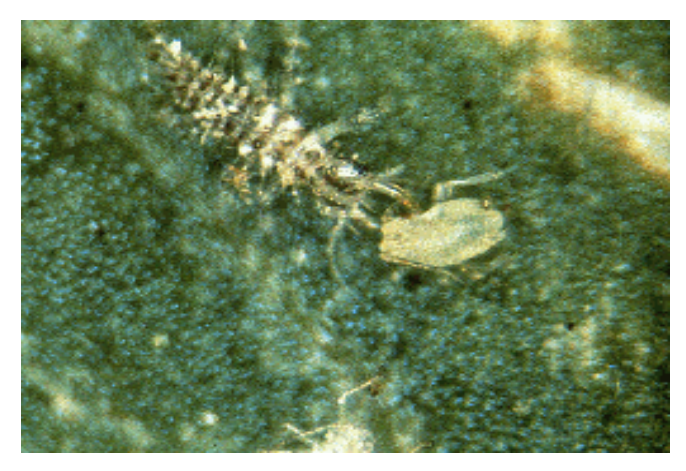
Figure 3d: Lacewing larva attacking aphid.