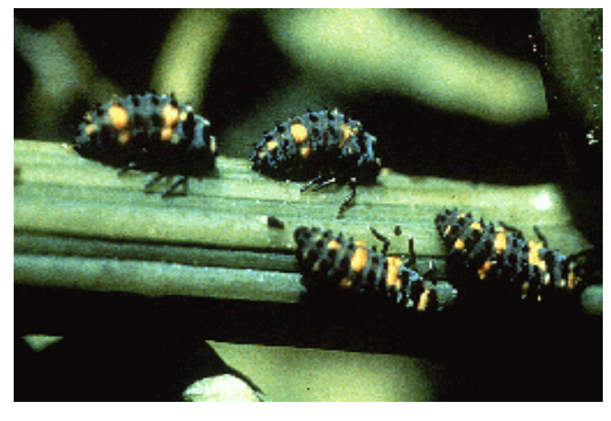
Figure 3b: Lady beetle larva.