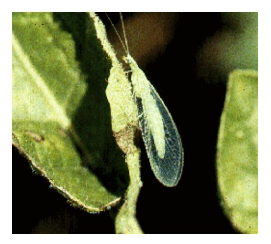
Figure 3c: Lacewing adult.