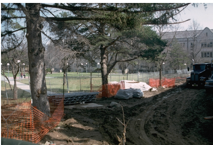
Figure 4: Construction vehicles can damage the existing soil structure by compressing soil particles.

It is easier to avoid soil compaction than to correct it. Keep construction traffic and material storage away from tree root areas. Mulch with 4 to 6 inches of wood chips around all protected trees to help reduce compaction from vehicles that inadvertently cross the barricades.