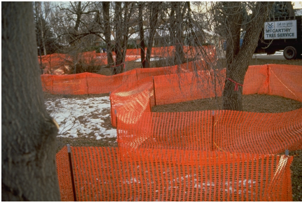
Figure 2: Highly visible tree protection barriers.

Once trees are selected for preservation, include specific preservation methods in the project plans and contracts. All parties should be aware of and agree to the consequences for noncompliance. To ensure compliance, contractors should have tree preservation bonds to cover noncompliance fines. Fines are based on species, tree value, and the amount and type of damage done. These bonds create an additional incentive for compliance.