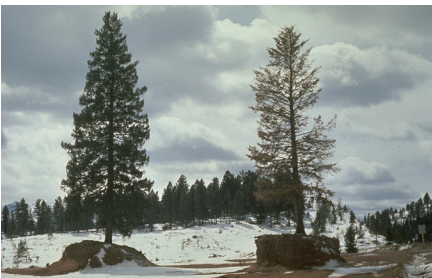
Figure 8: Lowering the grade severs roots and kills trees.