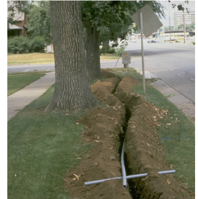
Figure 6: Trenching near trees can severely damage root systems.

To protect the tree, terrace the grade (Figure 9) or build a retaining wall between the tree and the lower grade. Walls should encompass an area extending at least to the drip line.