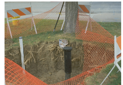
Figure 1: Roots lie in the upper 24 inches of soil and are easily damaged.

The root zone extends horizontally from the tree for a distance at least equal to the tree's height. Preserve at least 50 percent of the root system to maintain a healthy tree. During summer construction, trees require adequate water, enough to saturate the soil, every one to two weeks.