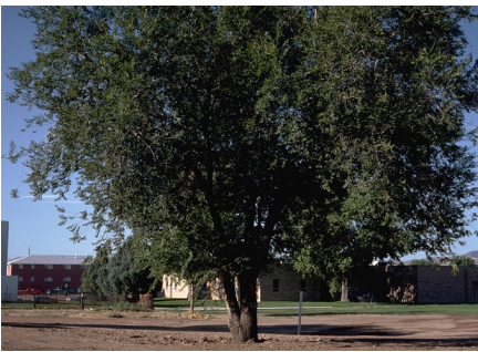
Figure 7: Within two years of adding 12 inches of soil, this tree died.