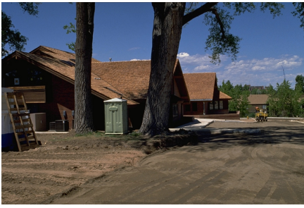
Figure 5: Surface grading severs many roots.