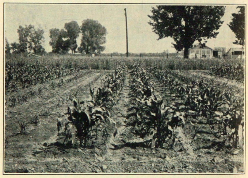
June 10 April 20 May 1 Corn planted at different dates on the Colorado Agricultural Experiment Station, Fort Collins, in 1921. Picture taken about July 1.

The data in this table were kindly furnished by Mr. R. E. Trimble, Meteorologist, Colorado Experiment Station, Fort Collins.