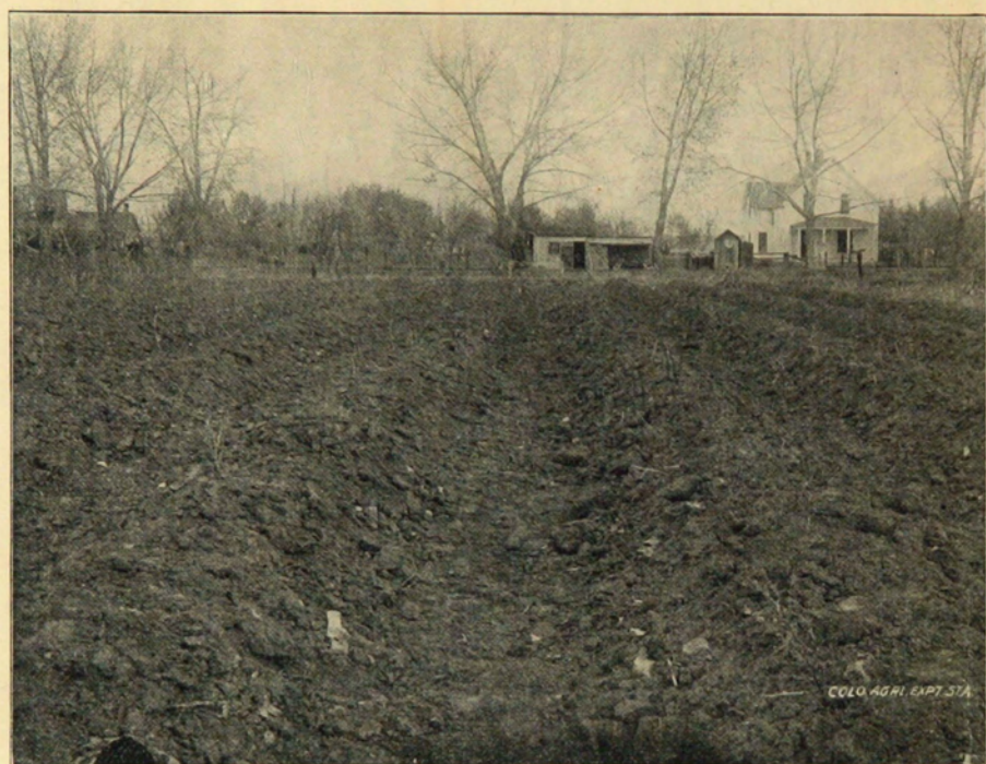
Figure 2. Raspberries well covered. Note the wide ridges which help to prevent the soil from rolling off of the sides and tops.

long before the rows will be growing on ridges. In order to keep this soil from forming into ridges it is necessary to remove it with a hand hoe from between the hills.