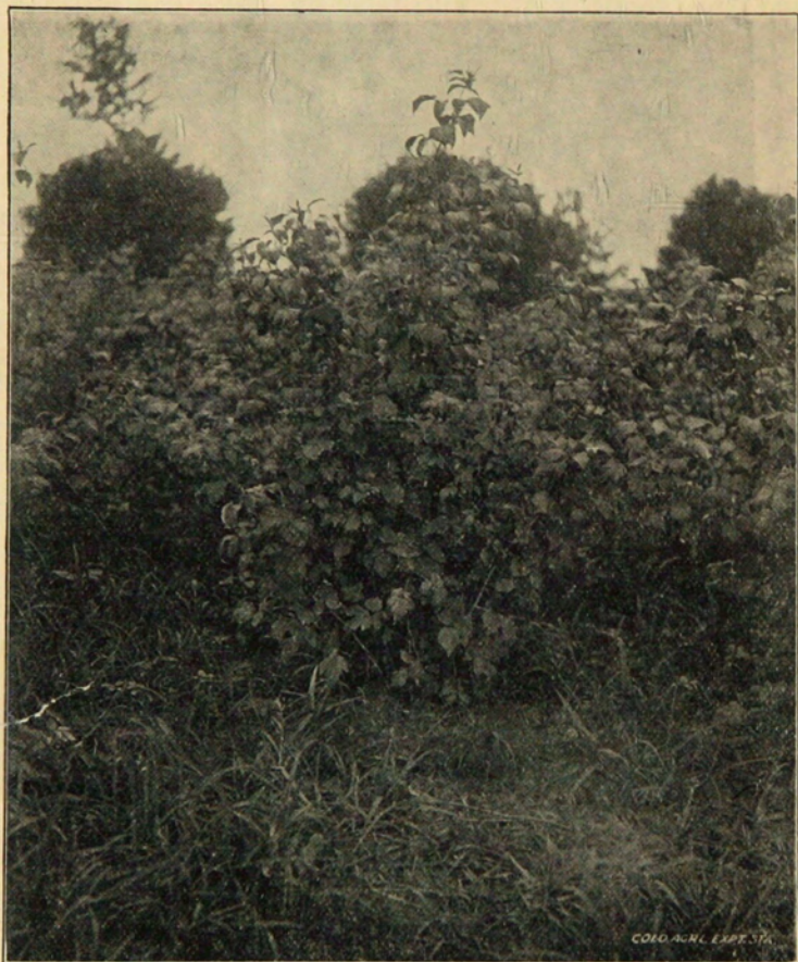
A good type of Cuthbert raspberry bush.