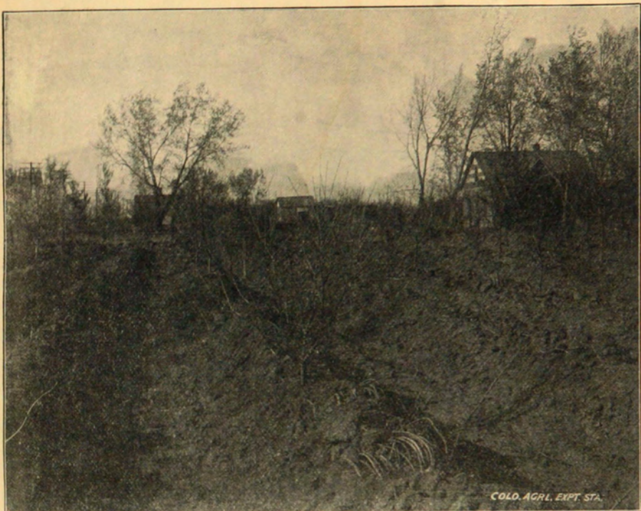
Figure 1. Raspberries not properly laid down and covered.

One of the vital phases in the protection of raspberries is that of uncovering in the spring. If uncovered too early they may be caught by late spring frosts and on the other hand, if uncovered late, the buds shoot out into white tender growth which may be killed by hot winds. A good plan would be to commence uncovering to within about one-half an inch of the canes, about the middle of April and to keep this up gradually for some time until the work was completed. This would give a chance for the young growth to harden off so as to resist the change of climatic conditions.