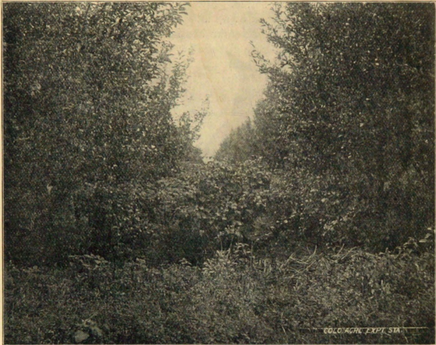
Figure 3. Raspberries growing in a fifteen year old apple orchard. Note stunted effect on the raspberries next to the trees.

Life of Plantation. —Eastern authorities claim that the best results are obtained when the plantation is not allowed to grow longer than six or seven years. In Colorado it is thought that with the proper management and care a raspberry plantation will last from twelve to fifteen years. There are in the Loveland district at the present time plantations twelve years old and these seem to be as thrifty as younger ones. It is hard to give the life of a plantation as this depends largely upon the care given it.