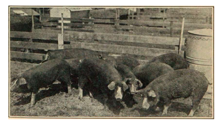
Pigs fed ground corn and ground millet without a protein supplement. They gained .60 pound daily at a cost of $9.76 for each hundred pounds gain.

Non-irrigated Eastern Colorado at present lacks a universal home-grown protein supplement comparable to alfalfa or clover in