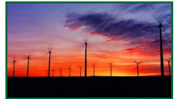
Ponnequin Wind Farm-Prowers County, Colorado

The CSCB has oversight for the following programs: