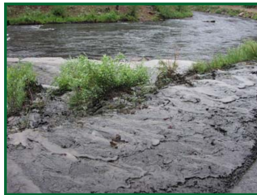
An eroding riverbank.

Each of the conservation districts has the responsibility to inventory the natural resource concerns within their respective areas and develop a plan to address these concerns. This activity is accomplished through partnership with various federal, state, and local governments and private organizations. Information about these plans are available through the Colorado State Conservation Board.