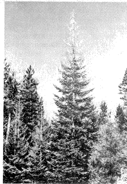
Figure 1: Damage to tree top caused by Douglas-fir tussock moth.

Chemical control may be used to prevent damage to high-value trees.