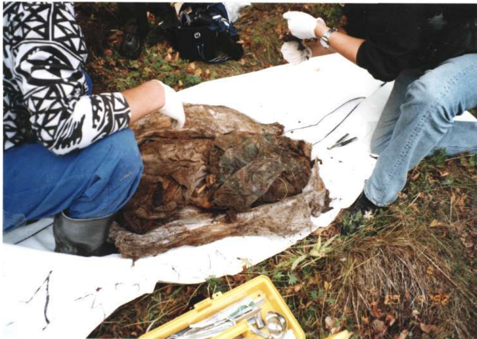
Photo 4. Fragmentary human remains from the first area being placed in a new body bag. Note the camouflage clothing mixed in with the remains. (Roll HY-024, Exp. 8)