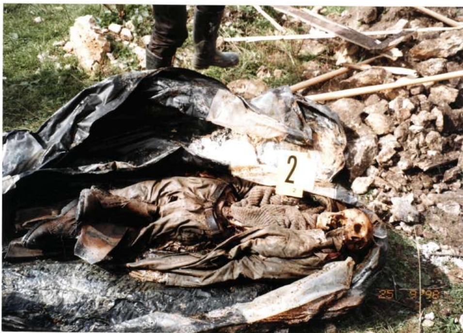
Photo 5. The remains from the second grave after exhumation. (Roll HY-024, Exp.13)