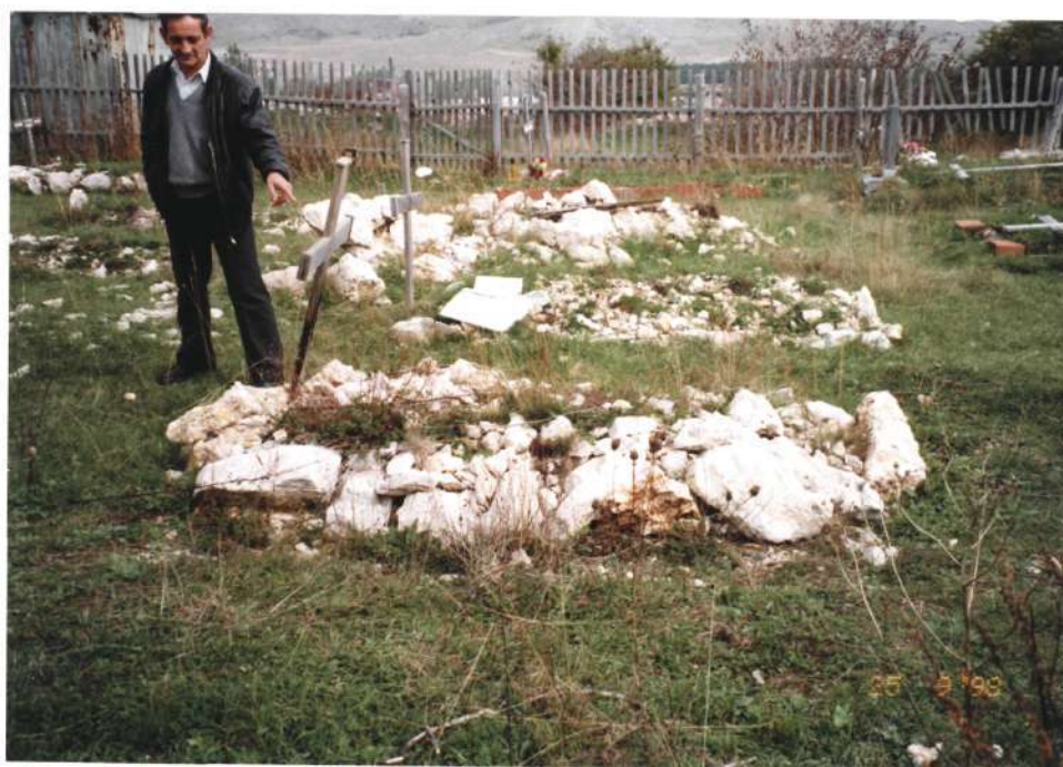
Photo 2. View to the north of the second grave. (Roll HY-024, Exp.6)