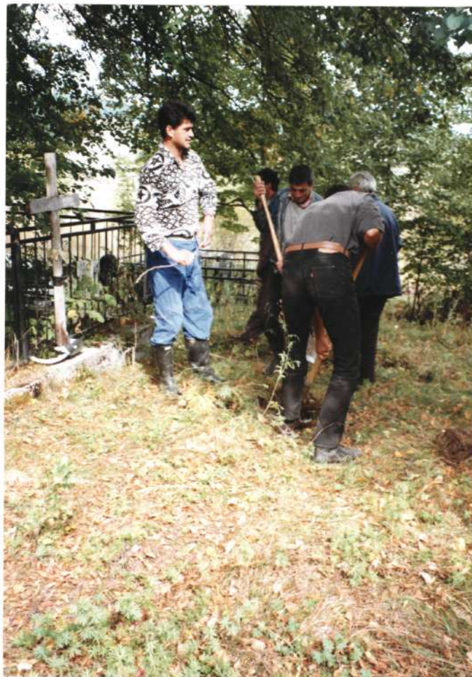
Photo 1. View to the north of clearing at the first area. Note the wooden cross with black and white marker tied to its base. (Roll HY-024, Exp. 3)