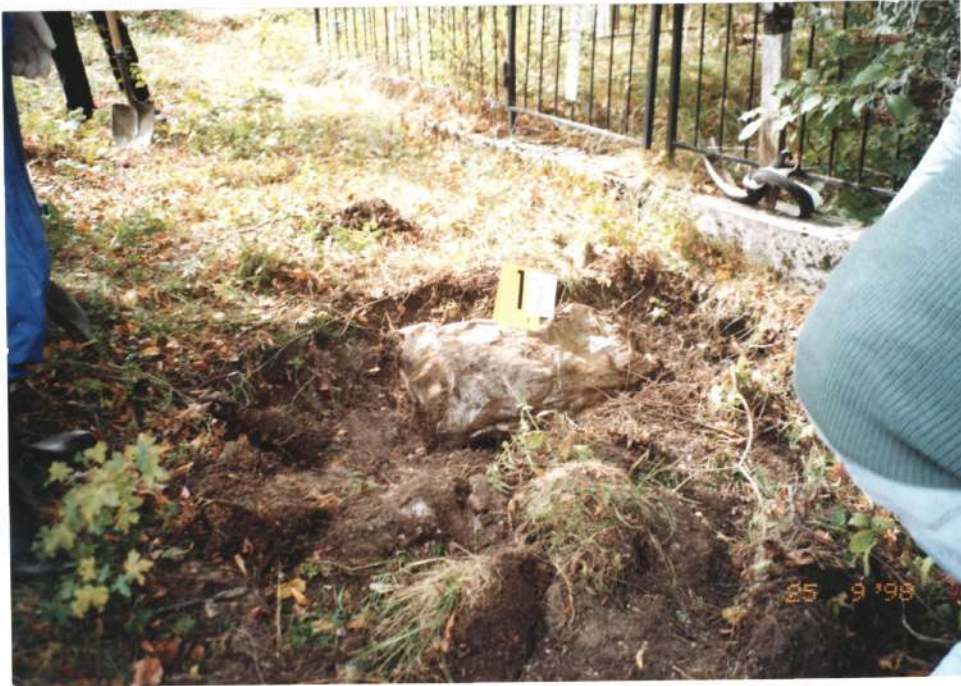
Photo 3. View to the northwest of the exposed plastic bag at the first area. (Roll HY-024, Exp. 7)