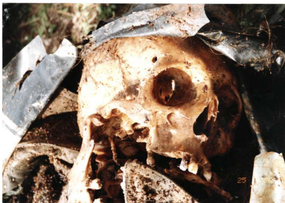
Photo 6. Perforation above the right eye orbit and silver coating a tooth and the inferior right mandibular corpus. (Roll HY-024, Exp. 15)