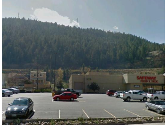
View of the eastern rock fall mitigation area from Colorado Boulevard, in front of Safeway