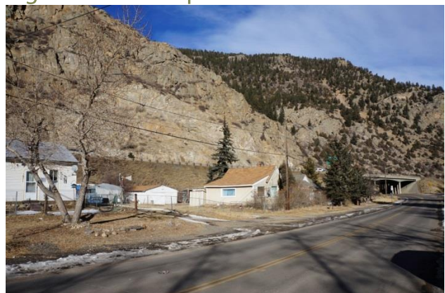
Figure 6. Viewpoint 2—The Town of Lawson

Viewpoint 2 is located within the town of Lawson looking east along County Road 308, south of the I-70 corridor (see Figure 6). This view represents that of adjacent landowners residing within the town of Lawson, which is positioned beneath the existing grade of I-70. The existing background view is dominated by the angular rocky bluffs of the surrounding peaks. The geologic history of the adjacent landscape is chronicled within the exposed rock that dominates the middle ground view for residents. Interstate 70 and the adjacent signage screen a portion of the views experienced since the town of Lawson is lower in elevation in comparison to the highway and accompanying bridge. The contiguous slope of the right-of-way down from the interstate and the residences and yards along County Road 308 complete the foreground views, which consist of native grasses, exposed rock, and the residences of Lawson. These visual elements create a vivid experience for adjacent landowners and pedestrians walking along County Road 308. Although the existing mitigation of I-70 is evident by the material selections and attempt to blend the highway components into the surrounding landscape, the intactness of the view is ranked lower because of the existing interstate. The degree to which the viewpoint elements create a unifying visual impact is moderate.