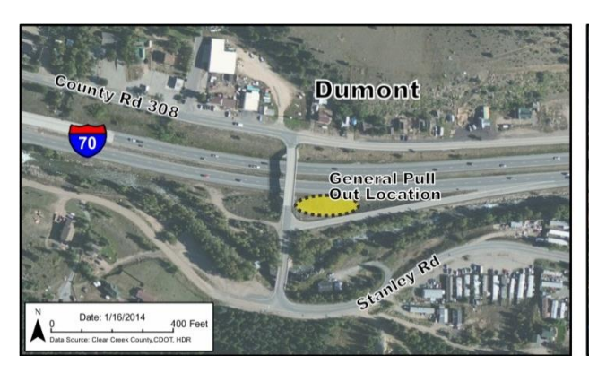
Figure 10. Emergency Pull Out Locations