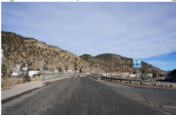
Figure 5. Viewpoint 1—SH 103 Bridge Replacement