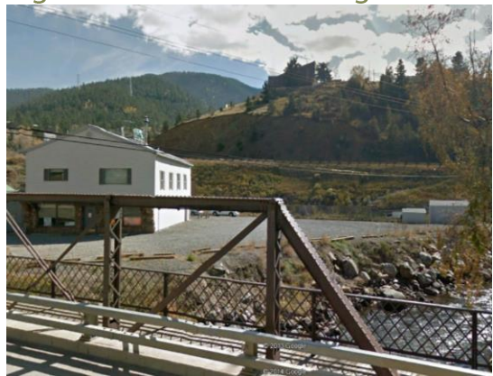
View of the western rock fall mitigation area from Miner Street, on the bridge over Clear Creek