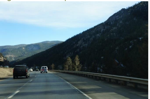
Figure 7. Viewpoint 3—Eastbound View (west of Idaho Springs)

Viewpoint 3 represents the eastbound motorist's view just west of Idaho Springs (see Figure 7). The existing background view is dominated by forested mountain views with varying hues of dark green, characteristic of a lodgepole pine forest. The middle ground view consists of the rugged foothills of Belleview Mountain to the north and facilities associated with the historic Stanley Mill to the south. Foreground views are comprised of the existing highway guardrails with the banks of Clear Creek narrowly visible. These visual elements combine to create a modestly vivid experience for motorists traveling through the corridor. The intactness and visual integrity of the landscape rank as fair because of the mining structures, which are an intrusion into the forested landscape. The degree to which the entire viewpoint's elements create a unifying visual impact is moderate.