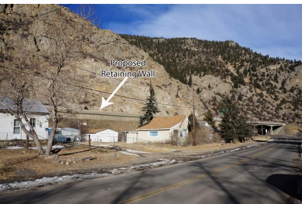
Proposed View with retaining wall