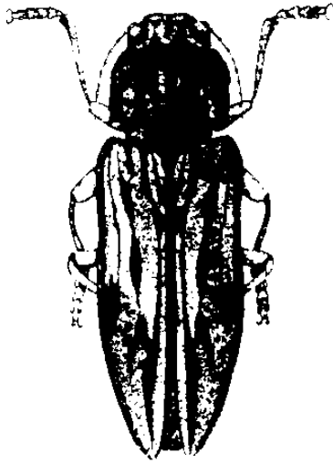
Typical long-horned beetle (top) and metallic wood borer (bottom).

Despite producing what may seem like great quantities of dust, borers rarely tunnel extensively enough to cause structural failure. Adult borers found inside the home may look ominous and pinch the skin if handled but are not dangerous.