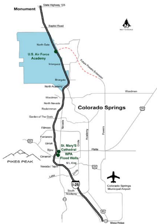
FIGURE 9-1 Location of Sites with a Section 4(f) Use

For each of these resources, the Proposed Action would use land of an historic property. The location of these resources is depicted in Figure 9-1.