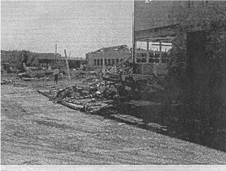
Oak Grove School