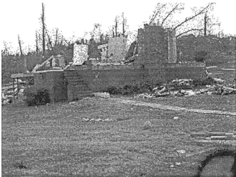
Split - level home - Sylvan Springs