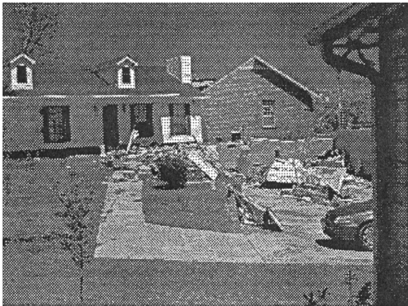
House pushed off foundation - Concord