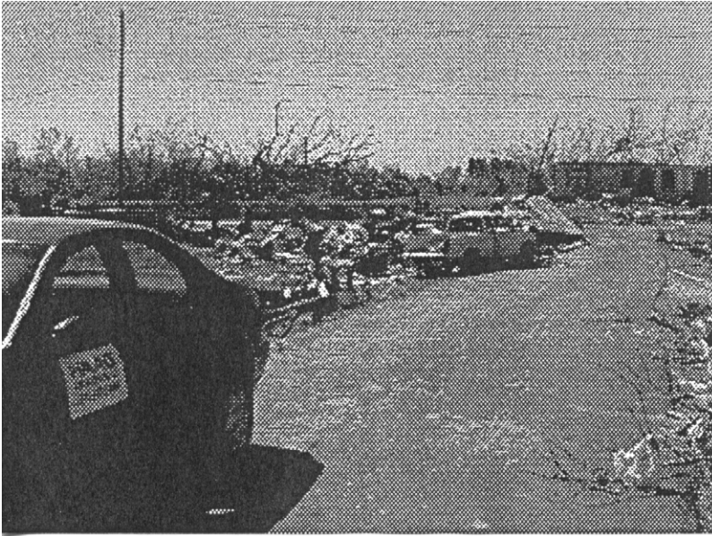
Warrior River Road - Concord