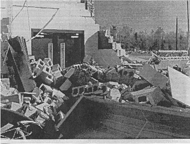
Oak Grove School Gym