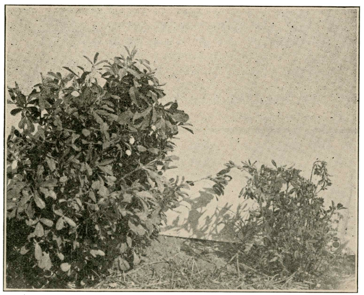
Fig. 1.—A normal alfalfa plant and a stunted, wilted plant with plugged water-conducting system.

The immediate cause of the wilting and stunting is the lack of water, for the water tubes in the roots that carry the water