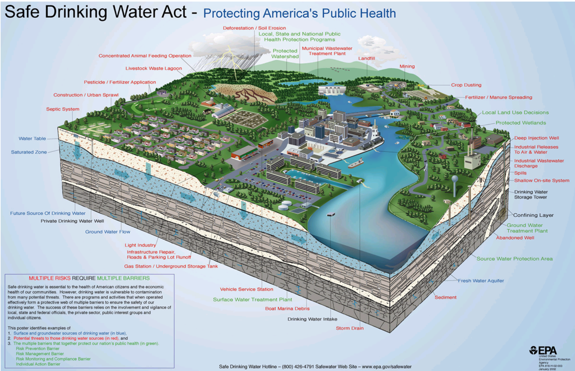
Figure 2. Examples of Potential Contaminant Sources and How Contaminants Can Enter Your Source Water.