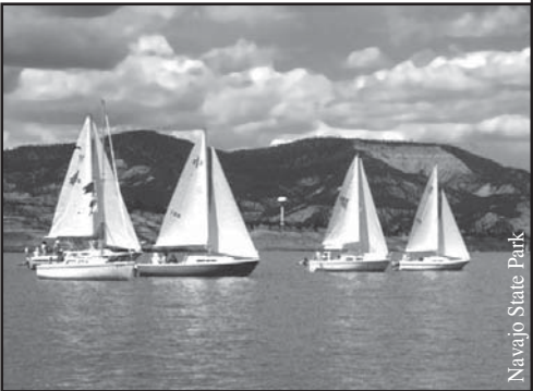
Navajo State Park