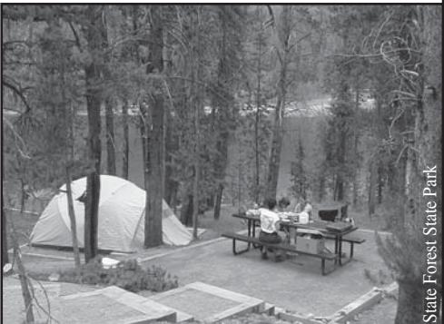
State Forest State Park