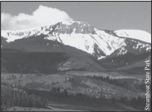
Steamboat State Park