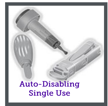
Auto-Disabling Single Use