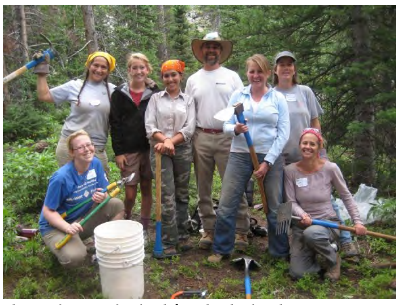
Above: Volunteers take a break from their hard work to snap a group photo.