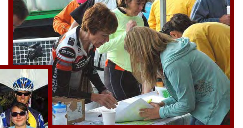
Above: Volunteers register riders for the 8<sup>th</sup> Annual Eagle River Ride.

The eighth annual River Ride took place on Saturday, July 25<sup>th</sup>. SOS had over 50 volunteers, many of whom were SOS students, volunteering with this year's event.