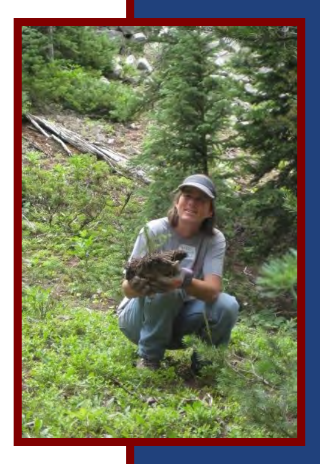
Governor's Commission on Community Service Colorado Cares Day 2009 Annual Report