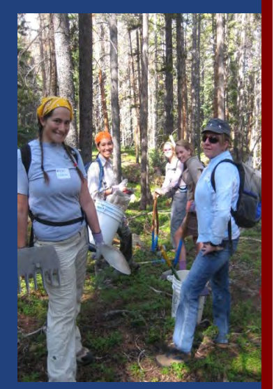
Above: AmeriCorps members and Alums traveled to Breckenridge to help construct part of Turk's Trail.