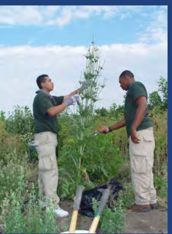
Above: MHYC members plant a new tree at Bluff Lake. Below: Members dig a ditch to improve water irrigation.