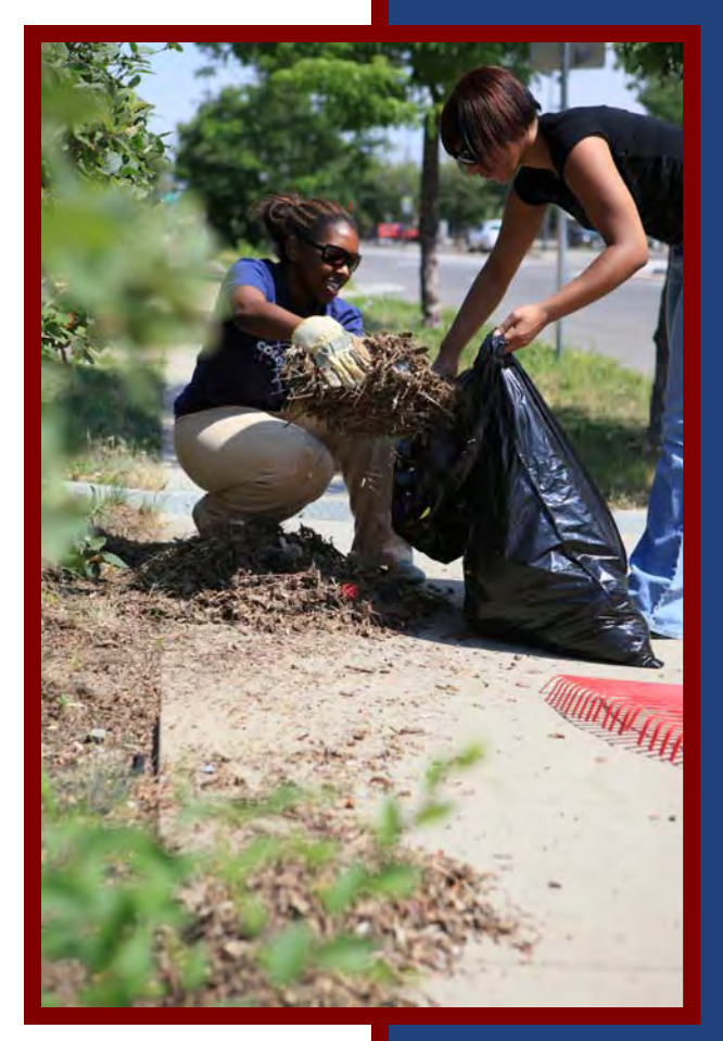
Governor's Commission on Community Service Colorado Cares Day 2009 Annual Report