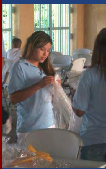
Above: YouthBiz set up tables and chairs, and helped serve food to seniors at the event.