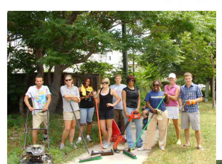
Above: AmeriCorps members worked hard to clean up the Five-Points neighborhood.