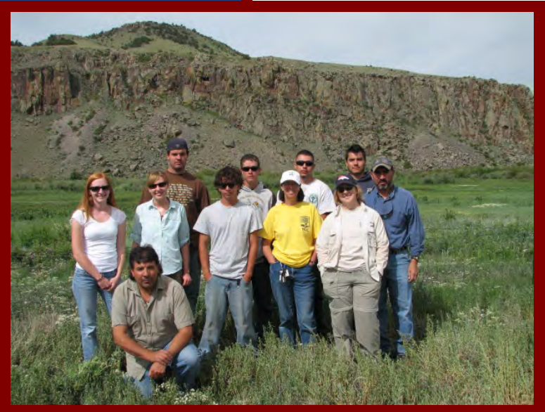
Volunteers help out at the Saguache Pulling 4 Colorado work site on July 10<sup>th</sup>.