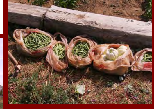
Above: Food collected from the gardens went to the local food bank.

Senior Hub, specifically the Retired Senior Volunteer Program (RSVP), is a major sponsor of the Adams County Community Gardens Project, which seeks to develop community gardens throughout the county. This program provides not only the gardeners with produce, but also local food banks, food fairs and farmers markets. Excess food is provided free or at minimal cost to help those on low and/or fixed incomes to stretch their family food budgets.