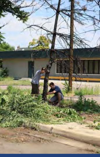
Volunteers cut down dead trees across from YouthBiz.

Denver's Five-Points community, originating in the 1880s, is one of the oldest and most historic neighborhoods in Denver. Five-Points, for some, is considered the "Harlem of the West" due to its long jazz history. It was the first predominantly African American neighborhood in Denver.