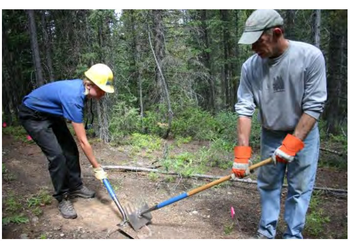
Left: Volunteers help to construct and restore the trail.