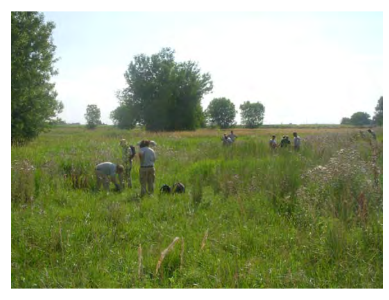
Left & Below: NCCC members helped clean up Barr Lake State Park for their last service project before graduation.