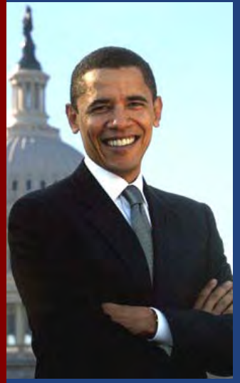
Barack Obama President of the United States of America

The summer initiative will culminate on September 11, 2009, a National Day of Service and Remembrance, but United We Serve is ongoing. The National Day of Service and Remembrance will recognize the summer's accomplishments, honor those who died on September 11, 2001 by serving in their memory, and encourage Americans to make an ongoing commitment to service.