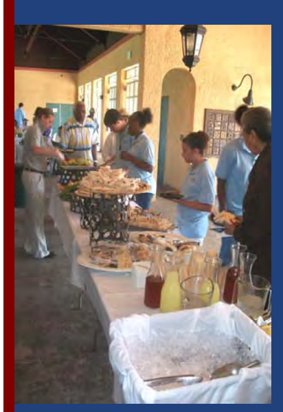
Above: AmeriCorps members help serve food at the 8<sup>th</sup> Annual King Trimble Tea and Roses Senior Social.