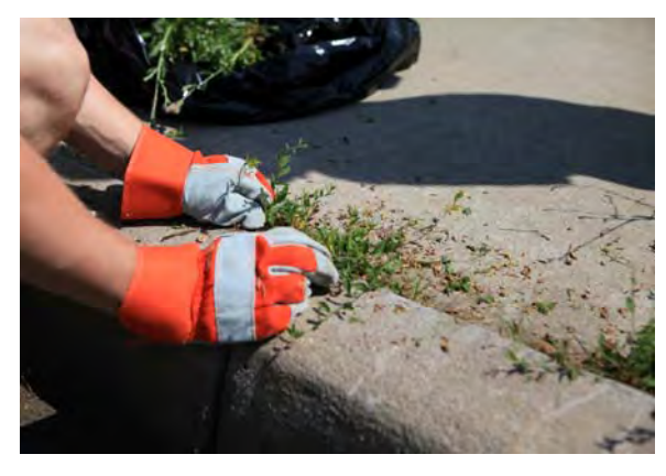
Volunteers spent the day weeding, cleaning up trash, and restoring the Five-Points Neighborhood.