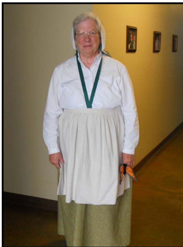
Volunteer storytellers were onsite to read to the children throughout the book drive.