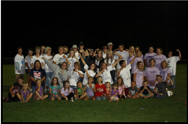
2011 Relay Under the Stars participants and volunteers.