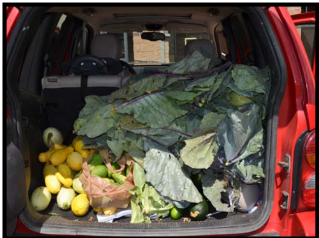
Some of the harvested produce.

Crossroads Community Gardens Workday offered Adams County families an opportunity to volunteer their time and gardening skills to better their community. Volunteers first weeded and watered the community garden. Then, the produce was picked to go to a local food bank. The garden serves those in the community who are in need of food assistance. In total, 650 servings were harvested for the food bank on Colorado Cares Day which clearly made a huge impact on fighting hunger in Adams County.