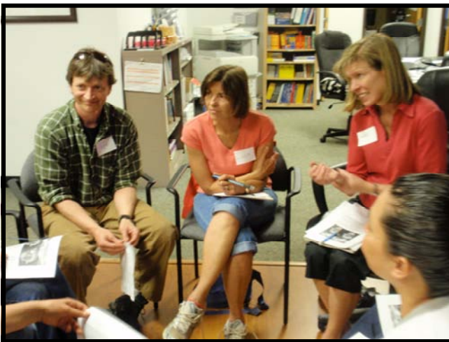
Intercambio volunteers learning valuable language skills.

In July, volunteers learned how to teach pronunciation, grammar and vocabulary. They learned how to involve the four language skills in all of their classes and came up with activity ideas using real-life objects. The group also participated in a short French lesson to see how it is possible to teach English without using the students' native languages.