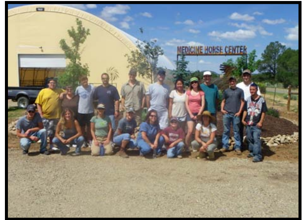
The great group of volunteers.

The RSAPP Rocks Medicine Center project consisted of building a rock wall around the newly-erected sign in front of the Medicine Horse Center on County Road J, south of Mancos. Volunteers prepared the sign area by shoveling and raking it into a circular shape and they then hauled and stacked rock, forming a wall around the sign. The rocks were gathered and hauled from an adjacent corral and performance area at the Center.