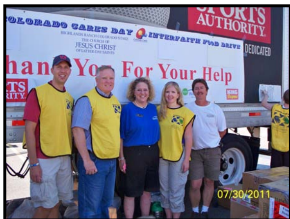
Volunteers extend their thanks to the community for their generous donations.

The Church of Jesus Christ of Latter-day Saints Highlands Ranch Stake, along with Windcrest Retirement Community, held their annual food drive for Inter-Faith Community Services on Colorado Cares Day. Thanks to Sports Authority, who donated boxes and a delivery truck to transport the goods, 8,500 pounds of food were donated to the food bank!