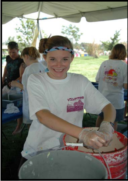
KidSpree Volunteer prepares for art activity.