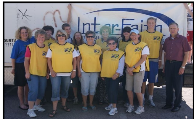
Volunteers pose for a group photo.