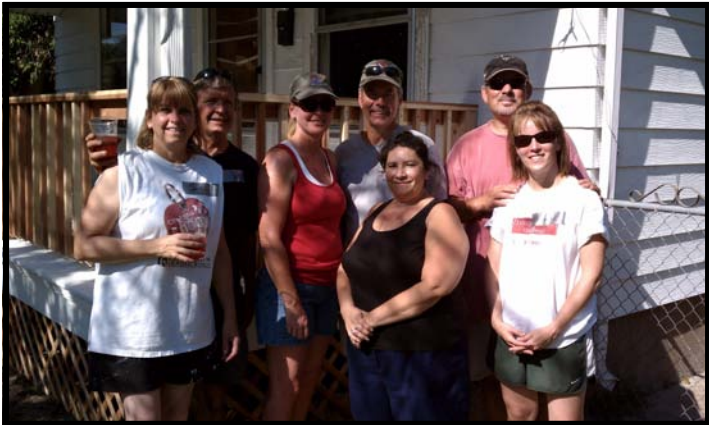
Watermelon water: having a refreshing drink after a long, hard day of work.

Extreme Community Makeover adopted specific blocks in the Globeville neighborhood in north Denver and identified outside home and neighborhood improvement projects with residents and organizations in this area through a door-to-door survey that took place two weeks prior to July 30. Nearly 200 people made up five different volunteer groups set to tackle 25 different neighborhood renewal projects.