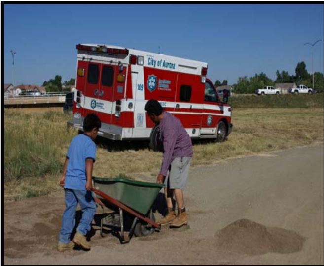
Volunteers moving materials using a wheel barrow.