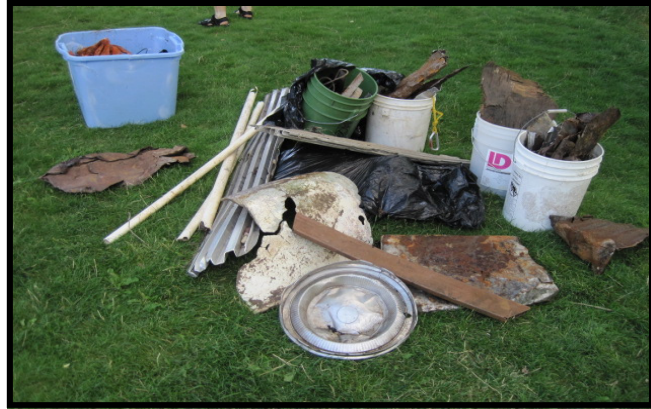
Some of the trash collected from the banks.

On Saturday and Sunday, July 30 & 31, a river cleanup was held along the banks of the Colorado River between Grizzly Creek and South Canyon near Glenwood Springs. This is an easy white water section of river that is heavily used by both private and commercial rafting parties, in addition to fishermen, hikers, bicyclists, kayakers, canoeists, and others. The high traffic and flotsam from drainage areas many miles above section ensures that some amount of trash will be left behind. For the second year, the volunteers focused on cleaning up this section to help ensure its beauty and the safety of visitors. Oh, and the volunteers also had a blast in the rapids between areas where they stopped to pick up trash. The event's organizers were especially pleased to see this event triple in size from last year, peaking with 13.