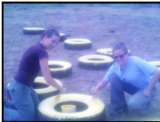
Teamwork gets the job done!