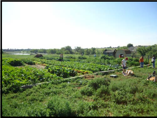
One of the community gardens.