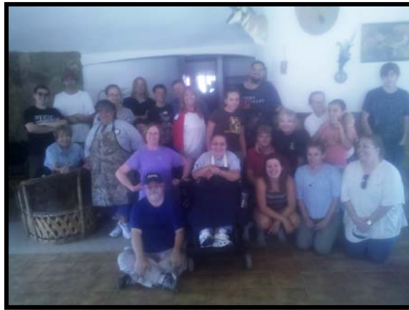
Group pictures of the volunteers.

On Colorado Cares Day this year volunteers conquered several work projects at Raven's Roost, which serves as a safe, nurturing place for people to grieve after a personal loss or tragedy. Volunteers noticeably improved the appearance of the property by painting a beautiful mural, re-painting an outside retaining wall, scraping and re-painting the front entrance, and re-painting tires along the landing strip on the property. Concerned about safety, volunteers moved wood away from the building to decrease the risk of fire, coated fireplace rocks with polyurethane, and moved dirt to help protect and insulate water pipes from freezing. With their generous donation of time and effort, volunteers helped Raven's Roost to function better so individuals and families in need can get the care and support they need during difficult times.