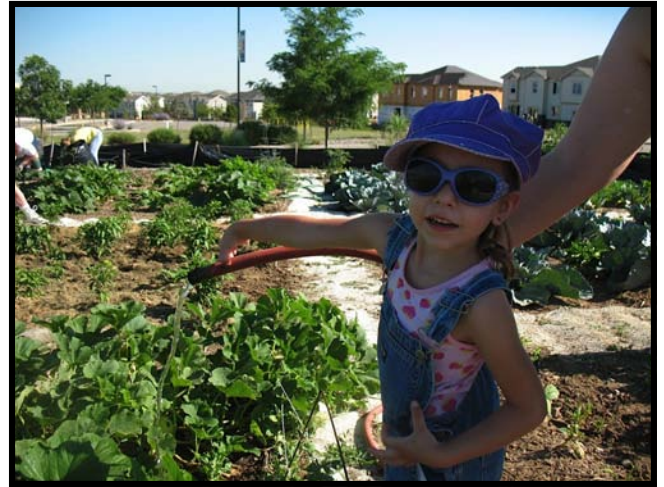
A young volunteer helps to water some of the crops.

On Saturday July 30, several of the 20 community gardens in the Adams Community Gardens Co-op held cleanup and harvesting events in honor of Colorado Cares Day. At least five gardens and an estimated 30-35 gardeners participated, ranging from 3 – 80 years of age.