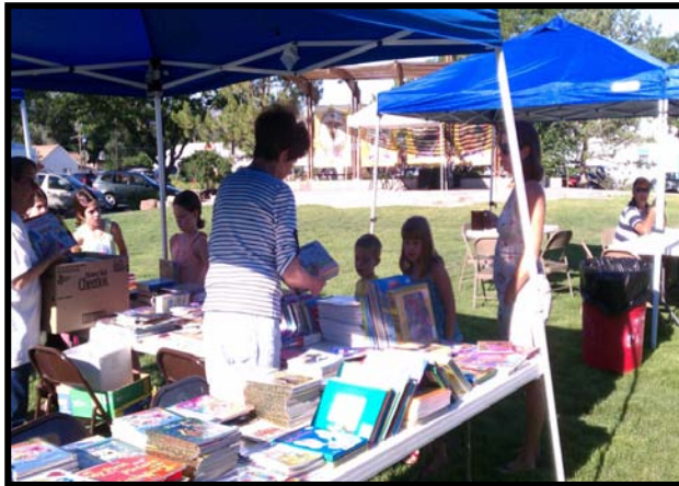
The book giveaway table.