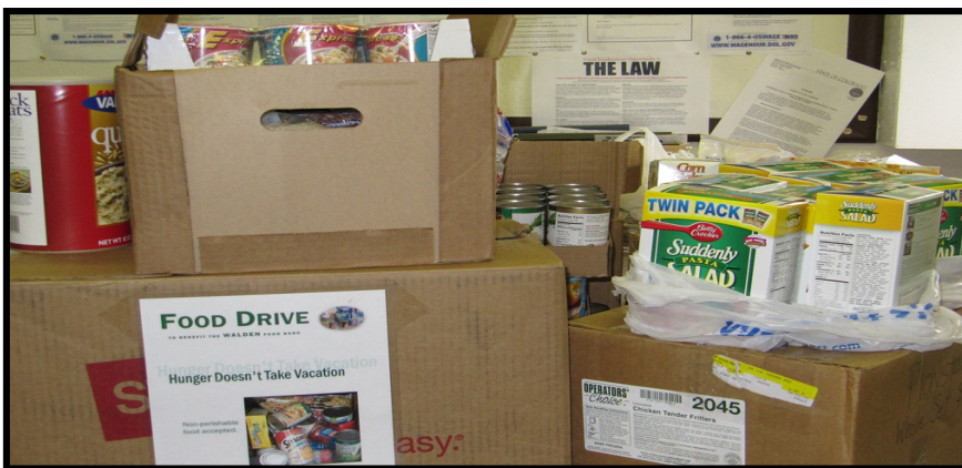
Boxes and boxes of donated food.