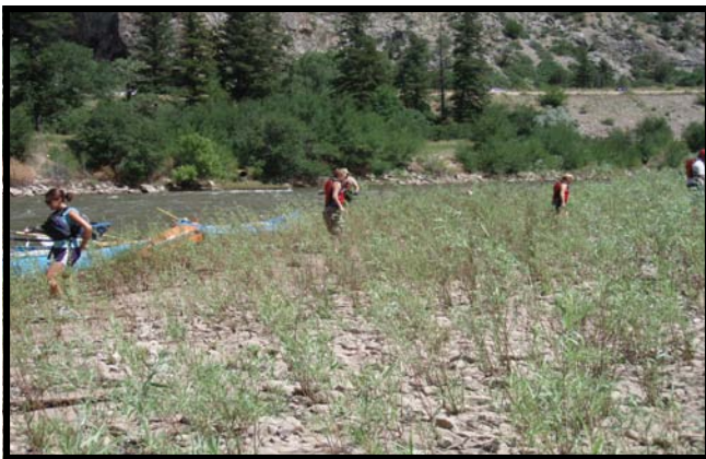
Volunteers searching for debris along the river.