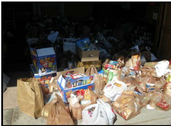
Bags and bags of donated food.

The Church had over 50 people help pick up and drop off bags and collected over 300 bags for the Food Bank of Roxborough. They filled two truck beds, a van, and a jeep with bags and bags of donated food.