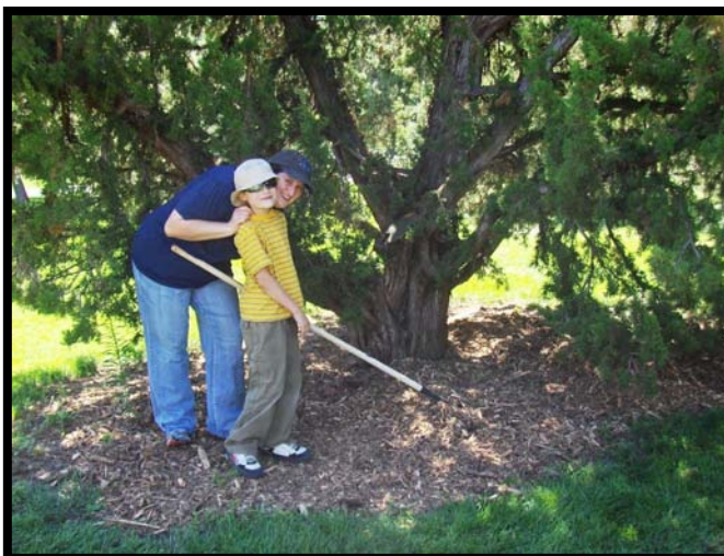
Raking wood chips and having a great time doing it!