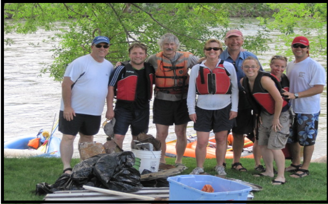
Volunteers pose for a group photo.