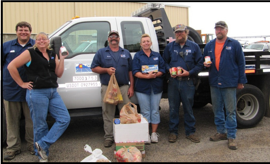
CDOT volunteers show off some of the food collected.

A food drive was held on Colorado Cares Day for the only food bank in Jackson County; Walden Food Bank, hosted by Mountain View Baptist Church. Volunteers and Pastor "Tex" sorted and categorized donations that were then prepared into food boxes to meet the needs of each individual family.