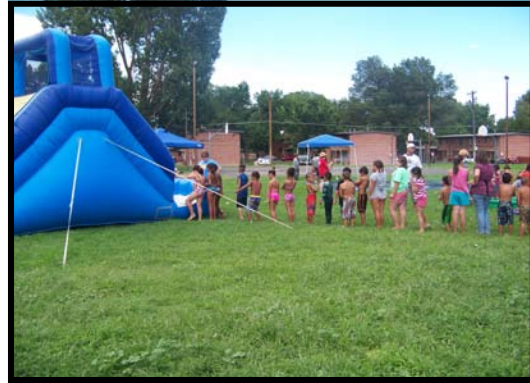
A line of children waiting for the water

PCC AmeriCorps partnered with the Boys & Girls Club of Pueblo to host a Water Day Extravaganza. Through donations by Wal-Mart, Care & Share, Catholic Charities Diocese of Pueblo, and McDonald's, they were able to provide snacks and the equipment needed to support this project. The kids enjoyed a waterslide along with water activities throughout the afternoon. It was a much needed relief from the heat for all who participated!