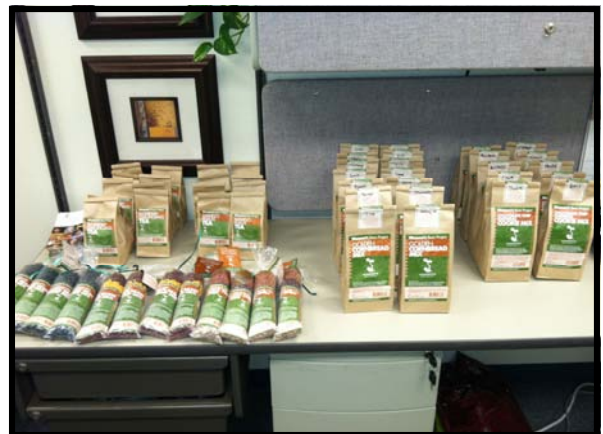
Donated food... Delicious!