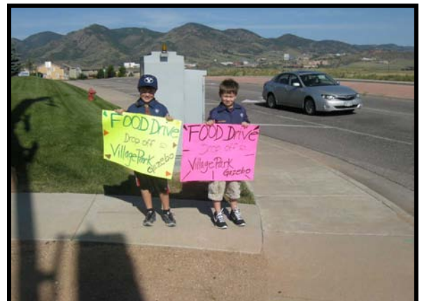
Young volunteers promoting the food drive.