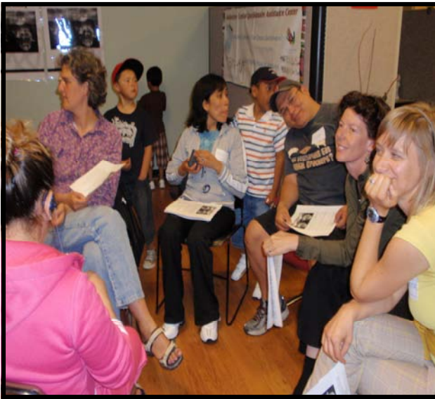
Volunteers getting to know one another at a training.

Intercambio offers monthly volunteer training workshops for individuals who would like to teach English to adult immigrants. The workshops are designed to be high-touch and volunteers leave with the basic skills necessary to teach English.