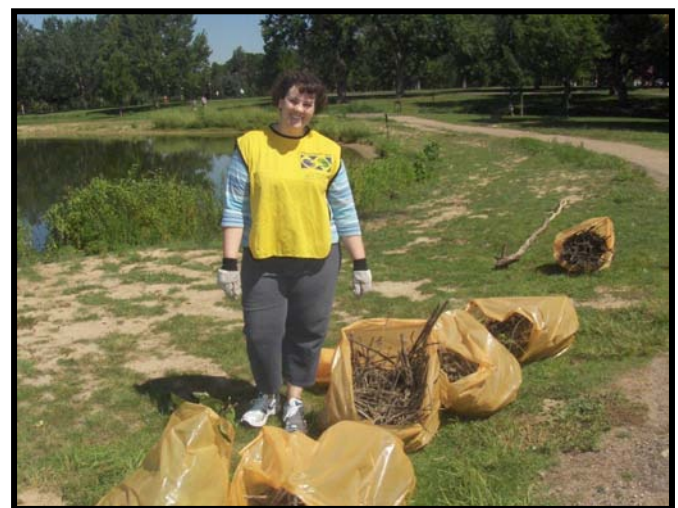
A volunteer picking up dead branches and litter.