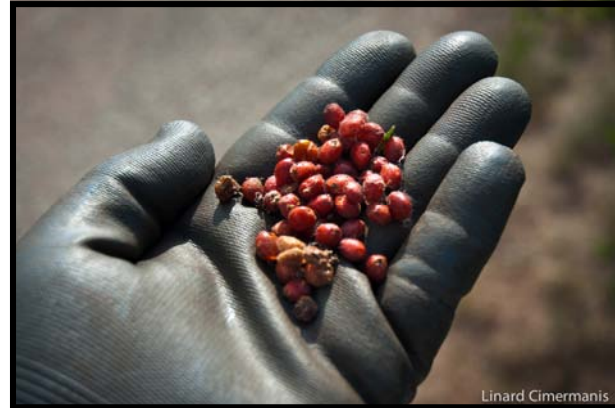
Three leaf sumac berries held by a volunteer seed collector at Hall Ranch, Boulder County.

Volunteers on Colorado Cares Day continued the summer tradition of helping to collect seeds of native plants, trees and shrubs to help strengthen the health of Colorado's native ecosystems. Colorado Cares Day and volunteers are critical to the health of native ecosystems in Colorado. Without this effort invasive species take over important habitats lessening the abundance of plant foods for native insects, birds and mammals.