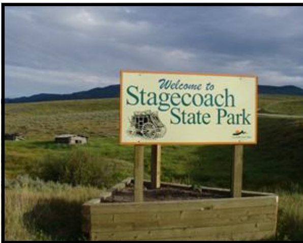
Entrance to Stagecoach State Park.

For Colorado Cares Day, volunteers participated in a clean-up of the Stagecoach Reservoir and surrounding areas. The event was open until later afternoon for park visitors to volunteer and help pick up litter along the park's trails and shorelines. Stagecoach Reservoir was in desperate need of a clean-up. The receding water levels left piles of debris and trash along the shoreline. Seven volunteers helped pick up litter by contributing 14 total hours of work in recognition of Colorado Cares Day. In total, the collected litter filled seven grocery size bags and included many fishing hooks, lines, and lures which are safety concerns for people and wildlife in the park.