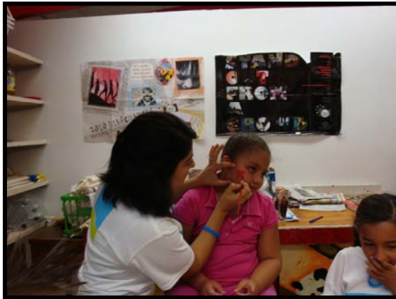
Every kid loves face painting!

In honor of Colorado Cares Day, 25 Kaiser Permanente employees and family members volunteered at the Broncos Boys & Girls Club on Friday, July 29. Volunteers and children at the club enjoyed a fun and active end of summer field day, including three-legged races, basketball, jumping rope and the always challenging egg-spoon race. At the end of the hot day, volunteers rewarded the kids with a watermelon feast. Over 200 youth visited the facility on July 29. In addition to providing volunteer time, Kaiser Permanente also helped by purchasing the food and supplies for the special day.