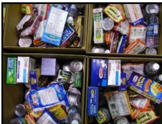
Boxes of donated food items.