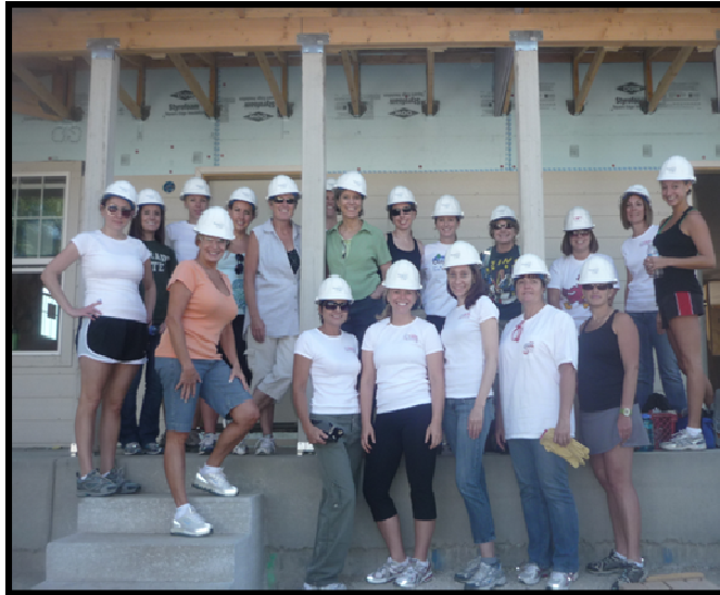
The wonderful ladies that make up the Denver CREW.

The Habitat for Humanity build was held on August 13 at a construction site located on Irving Street in Denver, Colorado. Eighteen of the Commercial Real Estate Women, (CREW) Community Outreach committee worked on the dry wall construction. Thank you to CREW Denver's 2011 Community Outreach Sponsor Perkins Coie and women build volunteers who gave their time and talents to this construction site. Other non-profits served by the Community Outreach committee in 2011 include the Work Options for Women, Women's Bean Project, and Junior Achievement.