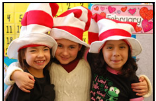
Photos of Aurora Public Schools students courtesy of the Aurora Public School Education Foundation webpage.