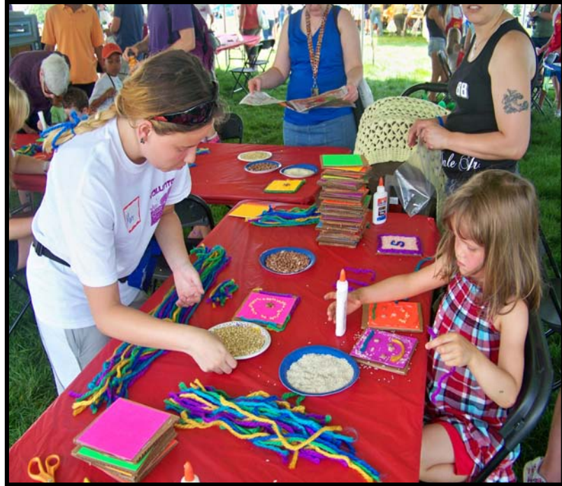
KidSpree volunteer organizes art project.