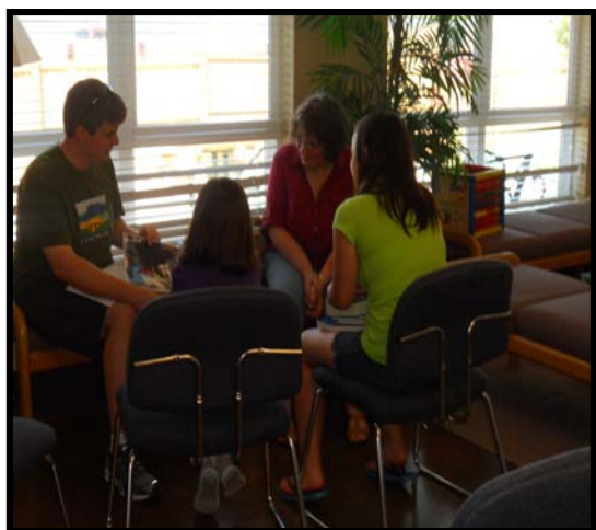
Volunteers read to children and families during the event.