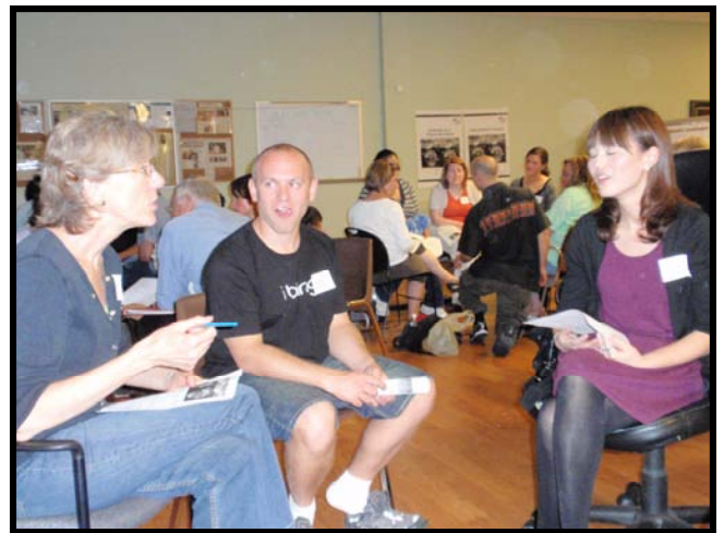
Split into smaller groups, volunteers practice teaching.

An impressive 20 volunteers completed the entire six hour training. These 20 volunteers will work with a minimum of 20 adult language learners over the next several months, teaching English and life skills, providing information on community resources and building friendships.