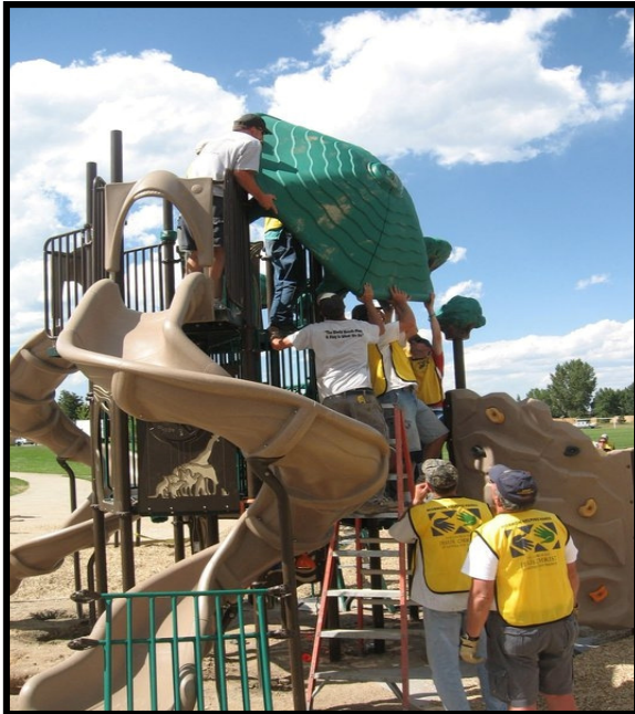
Volunteers lift the final piece of the play structure into place at the end of the day.

In partnership with Foothills Park and Recreation District, nearly 250 volunteers from the Columbine Stake of the Church of Jesus Christ of Latter-day Saints built a brand new, state of the art play structure at Powderhorn Park in South Jefferson County. The volunteers were also able to plant 28 new trees and vastly improve the condition of the park in just one day of hard, dedicated work. Their efforts to build a new playground will be truly enjoyed by youth in this community.