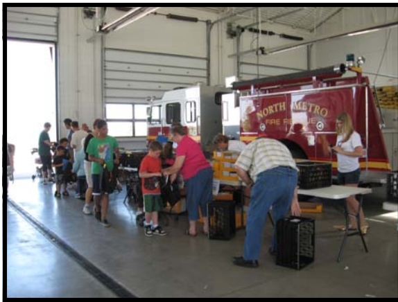
Volunteers working to stuff backpacks.

A Precious Child is a nonprofit organization devoted to making a positive impact in the lives of disadvantaged and displaced children by improving their quality of life and meeting their most basic needs such as clothing, shoes, coats, backpacks and school supplies.