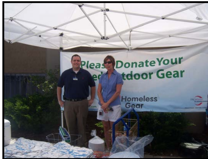
Homeless Gear volunteers take a break for a photo.