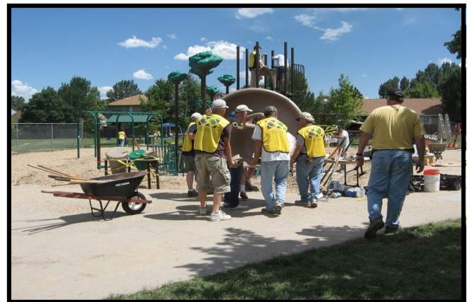
Volunteers carry a large slide to attach to the play structure.