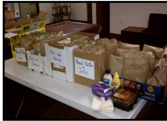
Lunch time: what it takes to feed 200 volunteers.