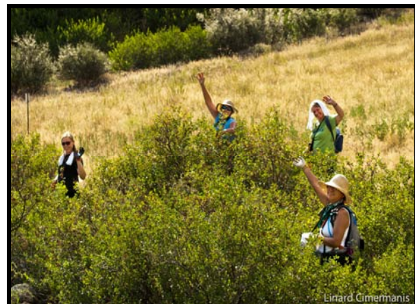
Seed collectors picking Three-leaf Sumac berries at Hall Ranch, Boulder County.