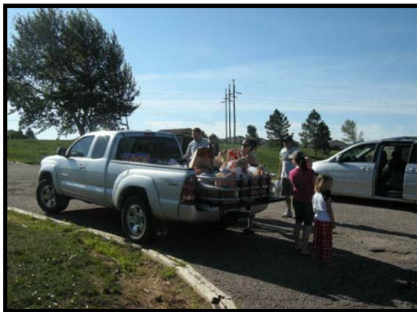
Loading the pick-up truck.