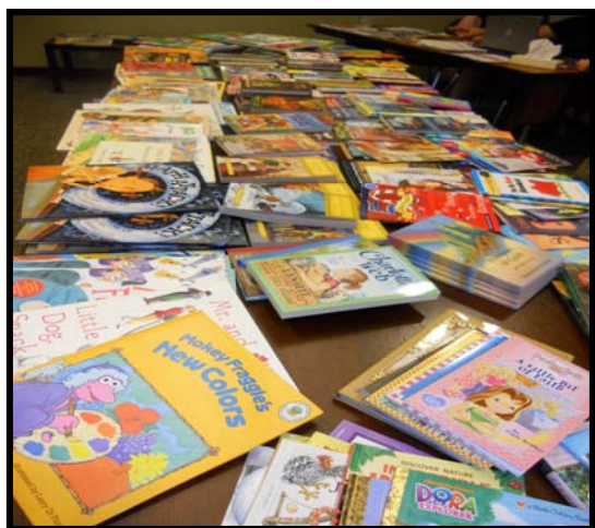
Free books donated by folks in the community.

In honor of Colorado Cares Day, AARP Colorado, with assistance from Serve Colorado and Volunteers of America, hosted a book drive in Larimer County. Donations of new children’s books were dropped off between July 18 and August 8 at the following locations: Fort Collins Senior Center, Learning Express Toys, King Soopers Marketplace, House of Neighborly Services, and Salt and Light Learning. The collected books were distributed to children through a local nonprofit, Homeless Gear, on August 13 for Colorado Cares Day. Because of the strong spirit of giving, hundreds of kids received new reading materials just in time for back-to-school.