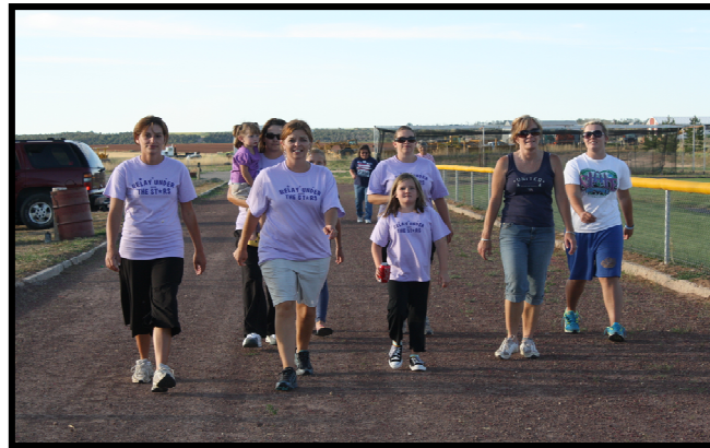
Volunteers walking at the Relay Under the Stars.

This year's Colorado Cares Day saw over 60 separate statewide projects that took place in 21 Colorado Counties: