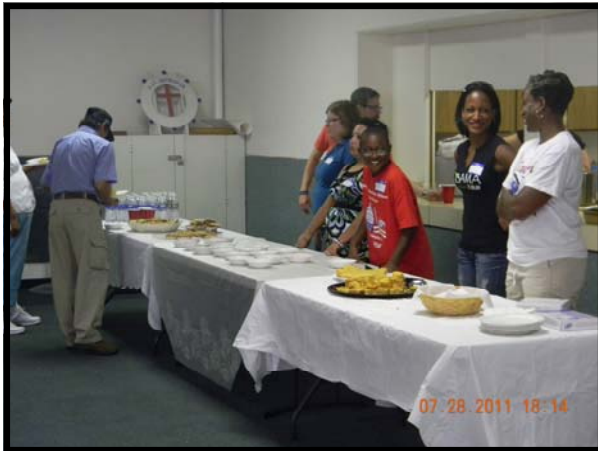
Setting up the food and beverage table.