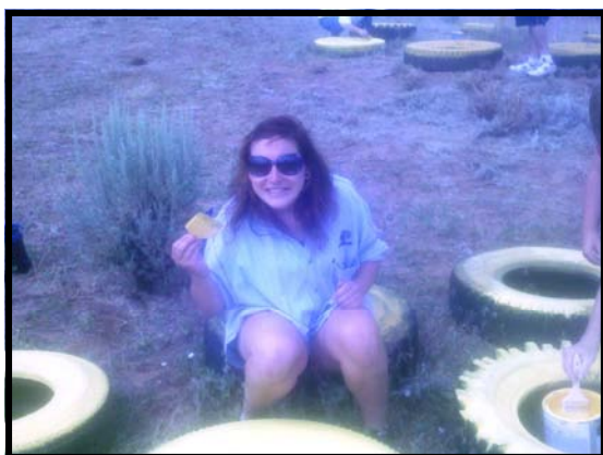
A volunteer excited to be helping out.

On Colorado Cares Day this year volunteers conquered several work projects at Raven's Roost, which serves as a safe, nurturing place for people to grieve after a personal loss or tragedy. Volunteers noticeably improved the appearance of the property by painting a beautiful mural, re-painting an outside retaining wall, scraping and re-painting the front entrance, and re-painting tires along the landing strip on the property. Concerned about safety, volunteers moved wood away from the building to decrease the risk of fire, coated fireplace rocks with polyurethane, and moved dirt to help protect and insulate water pipes from freezing. With their generous donation of time and effort, volunteers helped Raven's Roost to function better so individuals and families in need can get the care and support they need during difficult times.