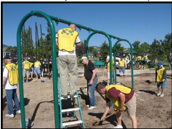
Workers are busy assembling parts of the playground structure and leveling ground in preparation for the surface material.

In partnership with Foothills Park and Recreation District, nearly 250 volunteers from the Columbine Stake of the Church of Jesus Christ of Latter-day Saints built a brand new, state of the art play structure at Powderhorn Park in South Jefferson County. The volunteers were also able to plant 28 new trees and vastly improve the condition of the park in just one day of hard, dedicated work. Their efforts to build a new playground will be truly enjoyed by youth in this community.