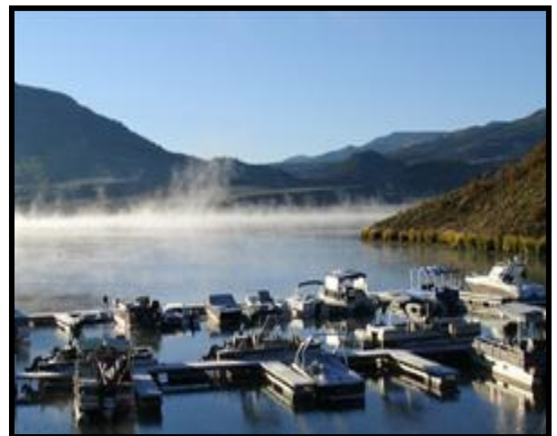
Misty view of the marina.