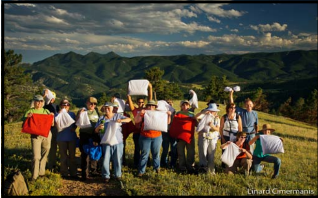
The volunteer crew with bags full of native seeds pose at Bald Mountain.