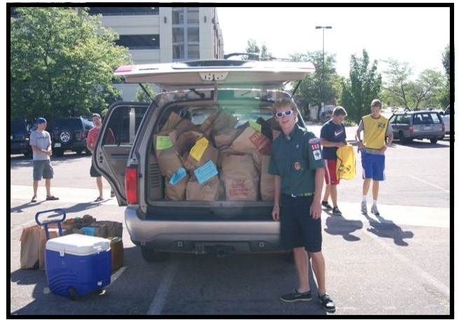
Another van full of donated food.