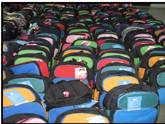
The finished product... stuffed backpacks for kids.