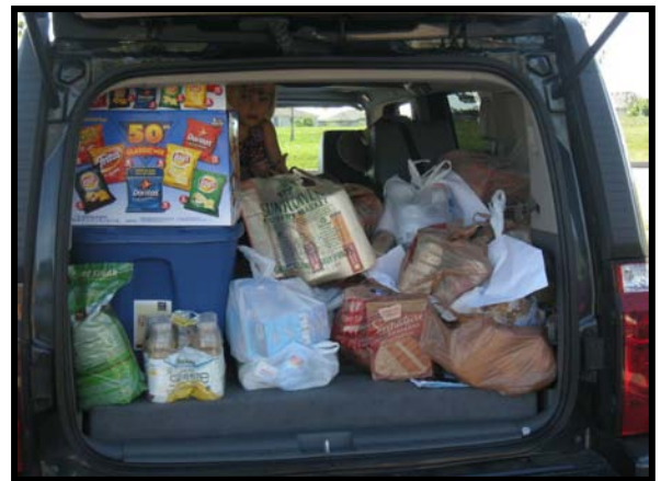
A volunteer's van full of food.