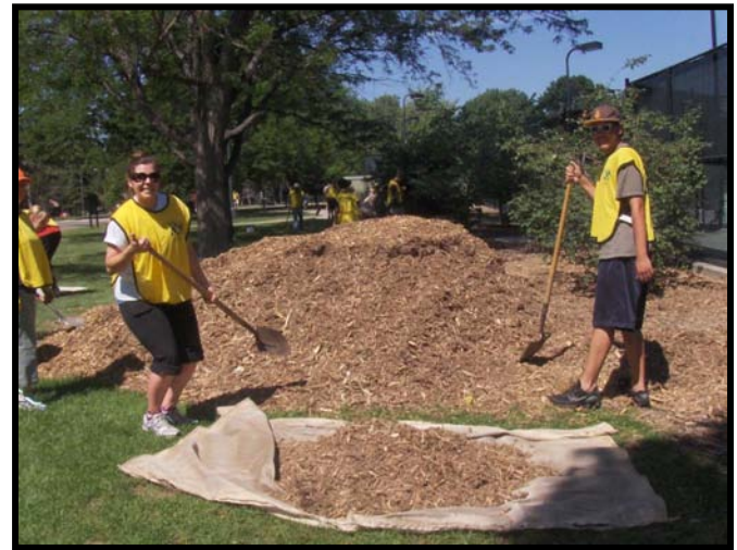
Volunteers take a break for a photo.