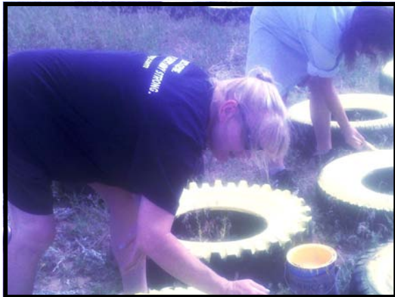
Volunteers paint tires on the landing strip.