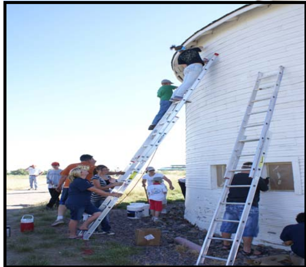
Volunteers painting and detailing farm structures.