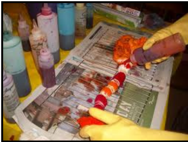
Putting dye on one of the t-shirts.

From the dyeing tables, participants were sent to the ice cream tables and served their desired flavor of ice cream. The event had 21 participants and everyone said they thought it was a great idea! The four adult and four youth volunteers who helped set-up and run the event expressed their encouragement to keep volunteering after seeing the joy on participants' faces. The party also helped raise awareness of the Youth Center's other community activities.