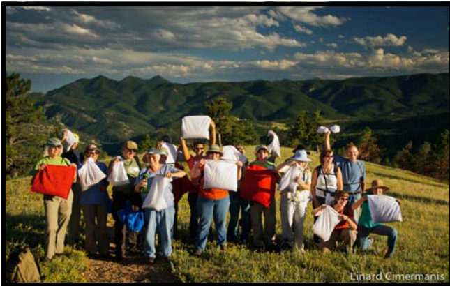
Volunteers from Boulder's Native Seed Collection.

Animals Disaster Relief/Recovery Human Services Arts & Culture Disaster Training Preparedness Painting Beautification/Clean-Up Distribution Poverty Fighting Building Education/Technology Public Safety Children & Youth Energy/Environment Seniors Civic & Community Essay or Oratorical Contest Tutoring Collections (Food, Clothing) Faith-Based Veterans Community Renewal Food Preparation Disability Service Health