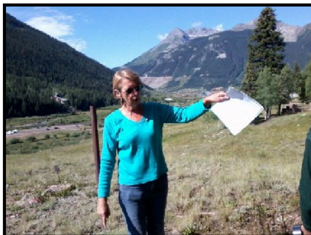
The project coordinator directing volunteers.

The Silverton Community Garden Clean-Up started at the local Cemetery early Saturday morning. Volunteers put solar lights on three graves that were adopted and will be cared for throughout the year. They then proceeded to the Visitors Center where weeds were pulled from the flower beds in front of the building.