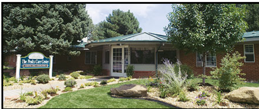
The Peaks Care Center, Longmont.

On Colorado Cares Day, approximately 200 volunteers from the Church of Jesus Christ of Latter-day Saints Longmont came together to give the Peaks Care Center some much needed improvements. The center is a local nursing home that truly appreciated the infrastructure improvement support. Volunteers participated in several activities including building garden beds for the residents, painting walls, retaining gazebos, and updating landscaping around the facility. Residents were thankful for the much needed “face-lift” to the facility.