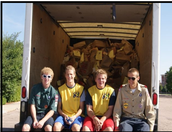
Boy scouts and volunteers pause for a quick photo.