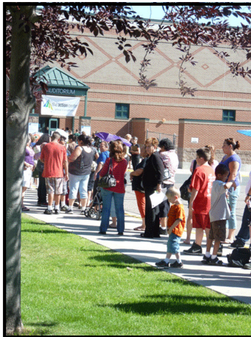
Students and parents waiting to pick up their packed school supplies.