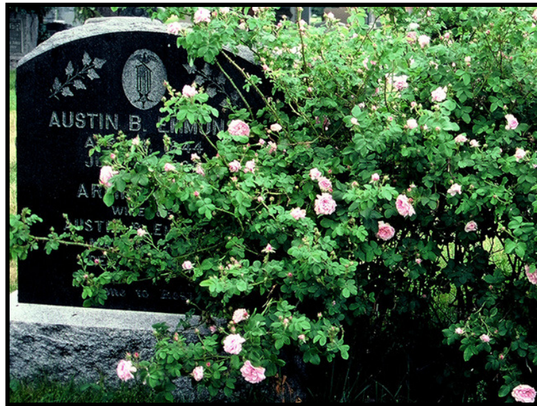
The gardens within the cemetery.

On Colorado Cares Day, 33 volunteers donated their time, supplies, and equipment to revive Riverside Park. Volunteers mulched and pruned trees and shrubs, pulled weeds, and completed an irrigation system. The new irrigation system ensures that the native trees and shrubs planted on Earth Day will get enough water to establish in several years and will no longer need to be watered manually. The park looked great after all of the hard work of the volunteers!