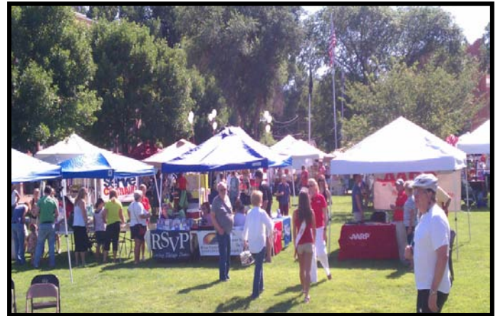
Agency booths during the Colorado Care's Day event.