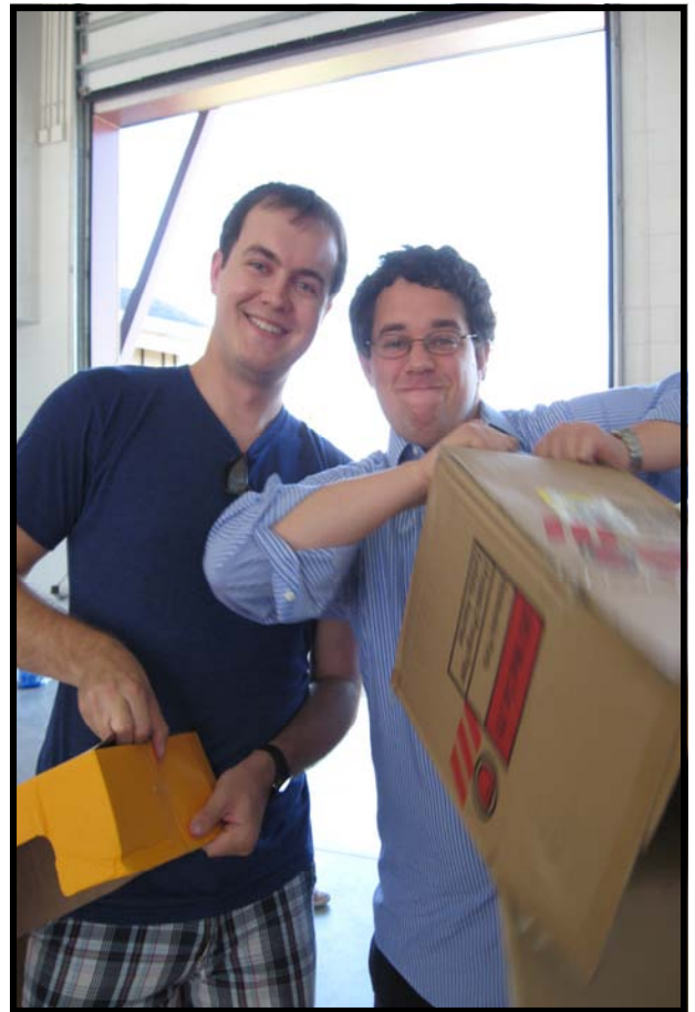
The Lieutenant Governor's staff hard at work.