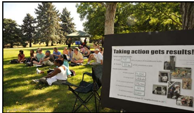
Colorado Cares Day volunteers watch Groundwork Denver staff role play what to do at each house for their Chaffee Park neighborhood energy action.