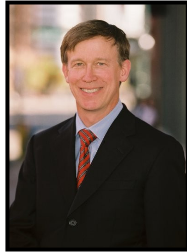
John Hickenlooper Governor of Colorado