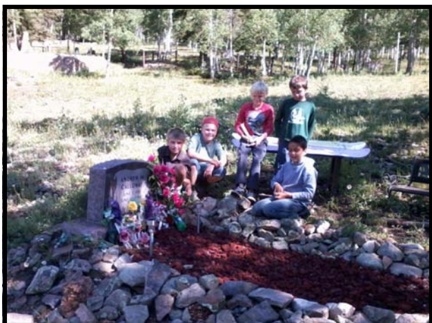
Young volunteers cleaning up an adopted grave.