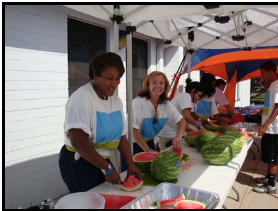
Kaiser volunteers getting ready for the watermelon feast and face painting at Broncos Boys & Girls Club.

In honor of Colorado Cares Day, 25 Kaiser Permanente employees and family members volunteered at the Broncos Boys & Girls Club on Friday, July 29. Volunteers and children at the club enjoyed a fun and active end of summer field day, including three-legged races, basketball, jumping rope and the always challenging egg-spoon race. At the end of the hot day, volunteers rewarded the kids with a watermelon feast. Over 200 youth visited the facility on July 29. In addition to providing volunteer time, Kaiser Permanente also helped by purchasing the food and supplies for the special day.