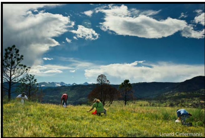
Volunteers collect Golden Aster, Bald Mountain, Boulder County.

Over 100 volunteers helped collect tens of thousands of seed from five species of native plants. These seeds were collected, cleaned and many are grown out, producing an exponential amount of seed for future restoration projects on public lands.