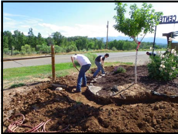
AmeriCorps members and volunteers preparing the site for placement of the rock wall.