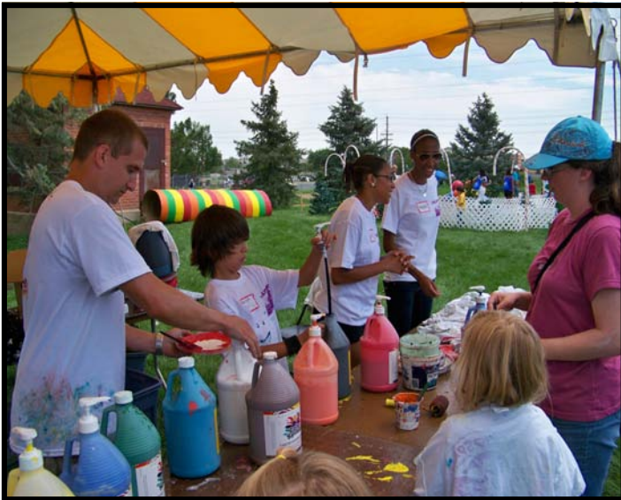
KidSpree volunteers assist children with finger painting.

An estimated 15,000 people enjoyed nearly 50 hands-on activities and entertainers this year at the City of Aurora's KidSpree on July 16-17 at Bicentennial Park. KidSpree is the Aurora-Denver area's only festival for kids. The event features free activities ranging from educational and recreational to the arts. Nearly 500 volunteers provided essential support at the festival, assisting artists, maintaining line control, directing children through mazes and answering questions from the public.