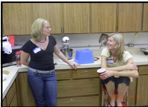
Volunteers taking a break in the kitchen.

More than 70 volunteers contributed to Family Night at the Colfax Community Network to give families a warm, nutritious meal and to share information about public health and partner programs that are available to families. The event offered the opportunity for everyone to have fun, get to know each other, and serve the community.