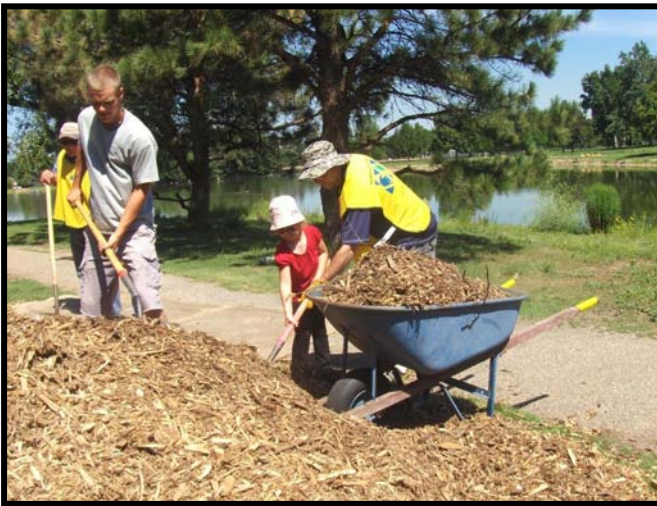
A group of young volunteers moving wood chips.

This year on Colorado Cares Day volunteers dedicated a morning to cleaning up Washington and Observatory Parks. Volunteers spread mulch in tree and shrub areas, removed suckers from trees, cleaned up the lake shore at Washington Park, and filled over 100 large trash bags with debris. Significant effort also was put into improving playground areas and making them safer by filling in fall areas near equipment.