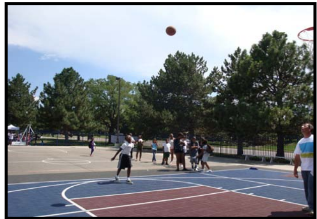
Basketball shooting contest at Broncos Boys & Girls Club field day.