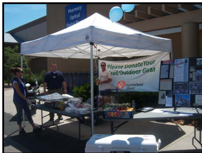
The Homeless Gear tent in front of Sam's Club.