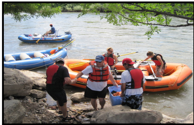
Unloading the trash from the rafts.