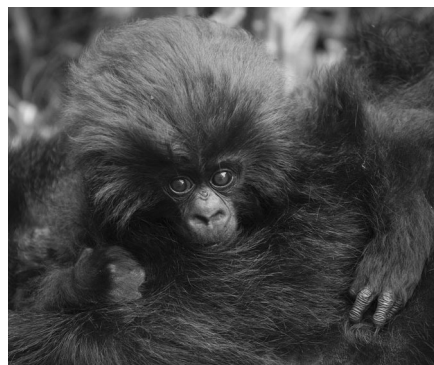
A young Virunga gorilla on the mother’s back

As with many types of wildlife tourism, viewing gorillas has grown in popularity since the 1980s. Currently tourists can visit more than 20 gorilla groups in the Virunga Massif and another 14 in Bwindi Impenetrable National Park, Uganda. Approximately 50,000 tourists visit mountain gorillas each year. Tourists can also visit Grauer’s gorillas in Kahuzi-Biega National Park, Democratic Republic of the Congo as well as see habituated western gorillas at four sites (Bai Hokou in Central African Republic, Mondika and Odzala