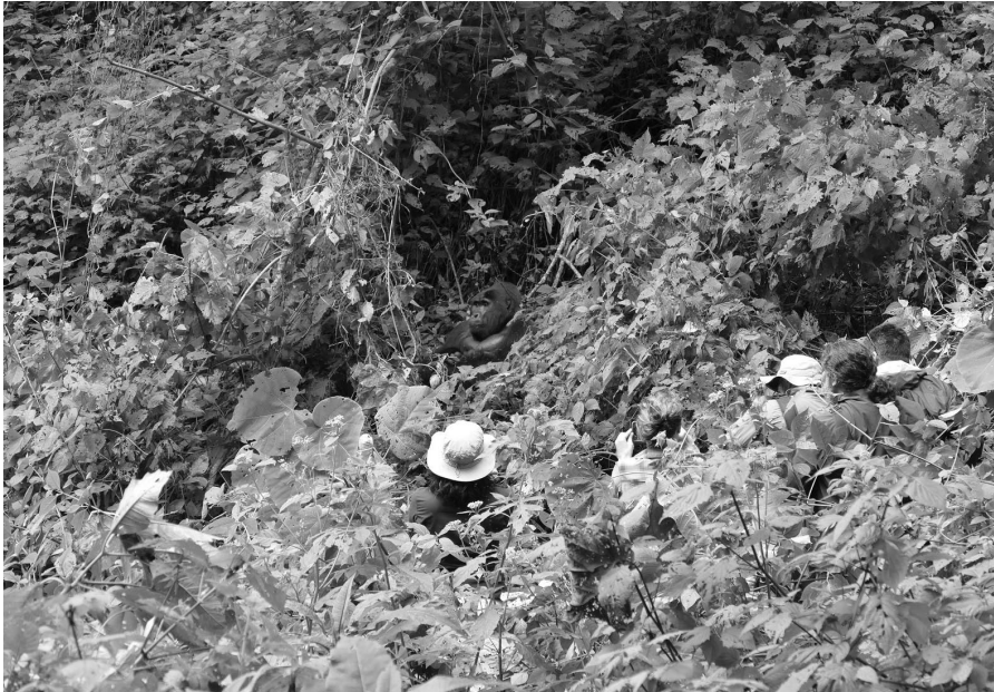
Tourists with Mukiza, Bwindi Impenetrable National Park