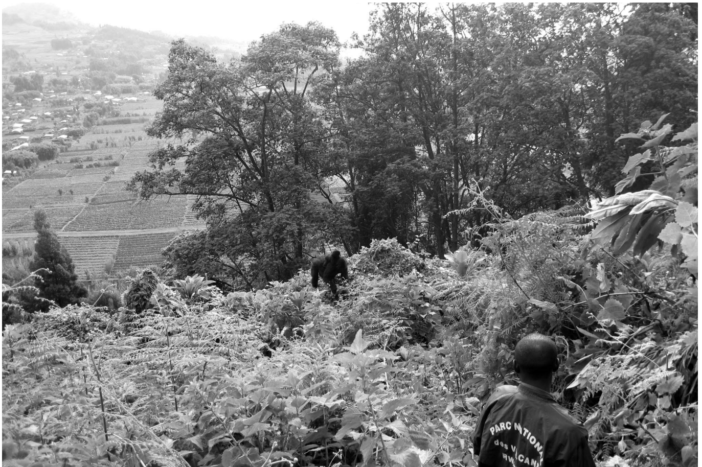
During a tourist visit of the Umubano group, Parc National des Volcans

What underlines best practice approaches is the precautionary principle – utilize as few gorilla groups as needed, take as few people as possible, and stay no more than one hour of viewing at a safe distance. It is even better to wear a mask or at a minimum at least a barrier (even a cloth bandana) to cover your nose and mouth in proximity to go-